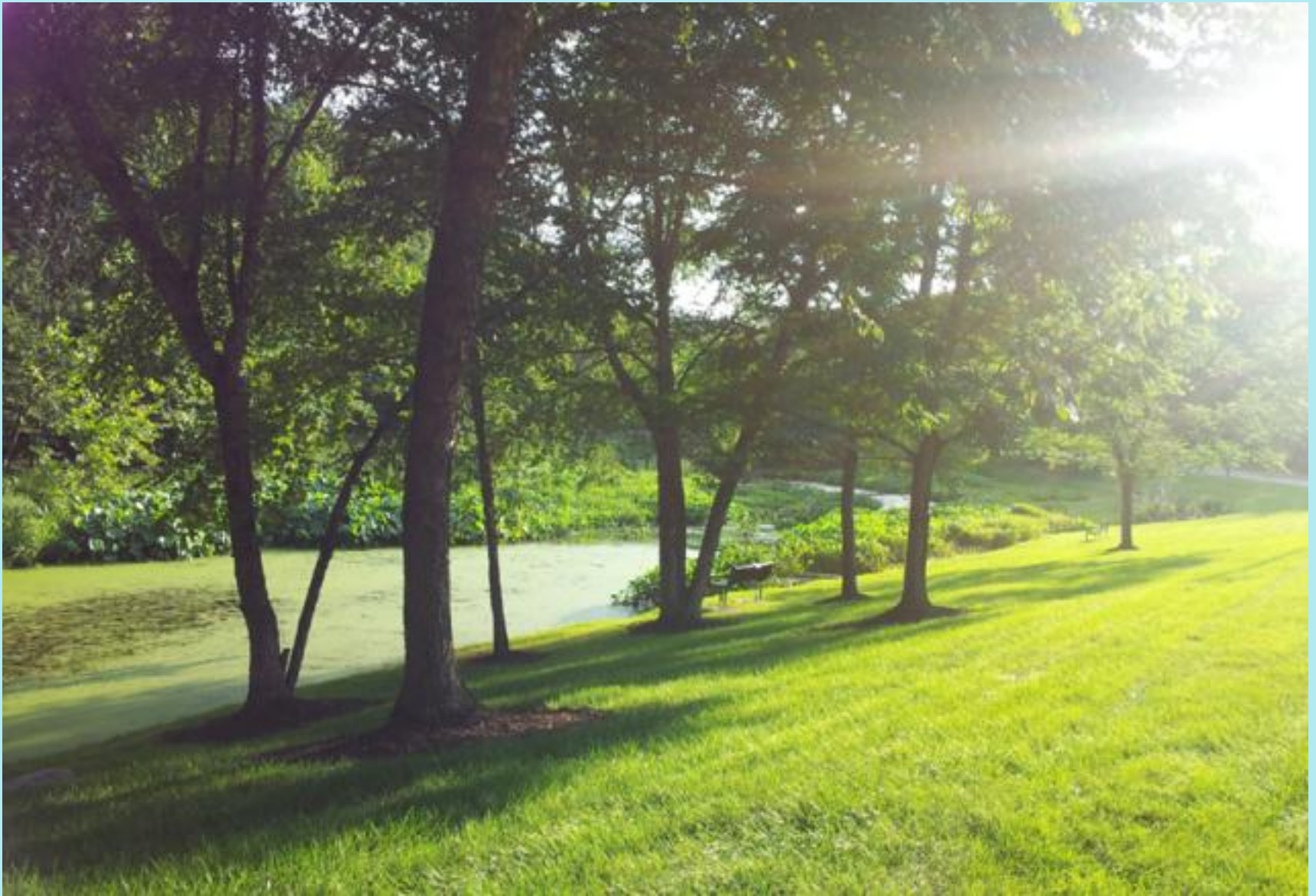
Looking back at the Wetlands.