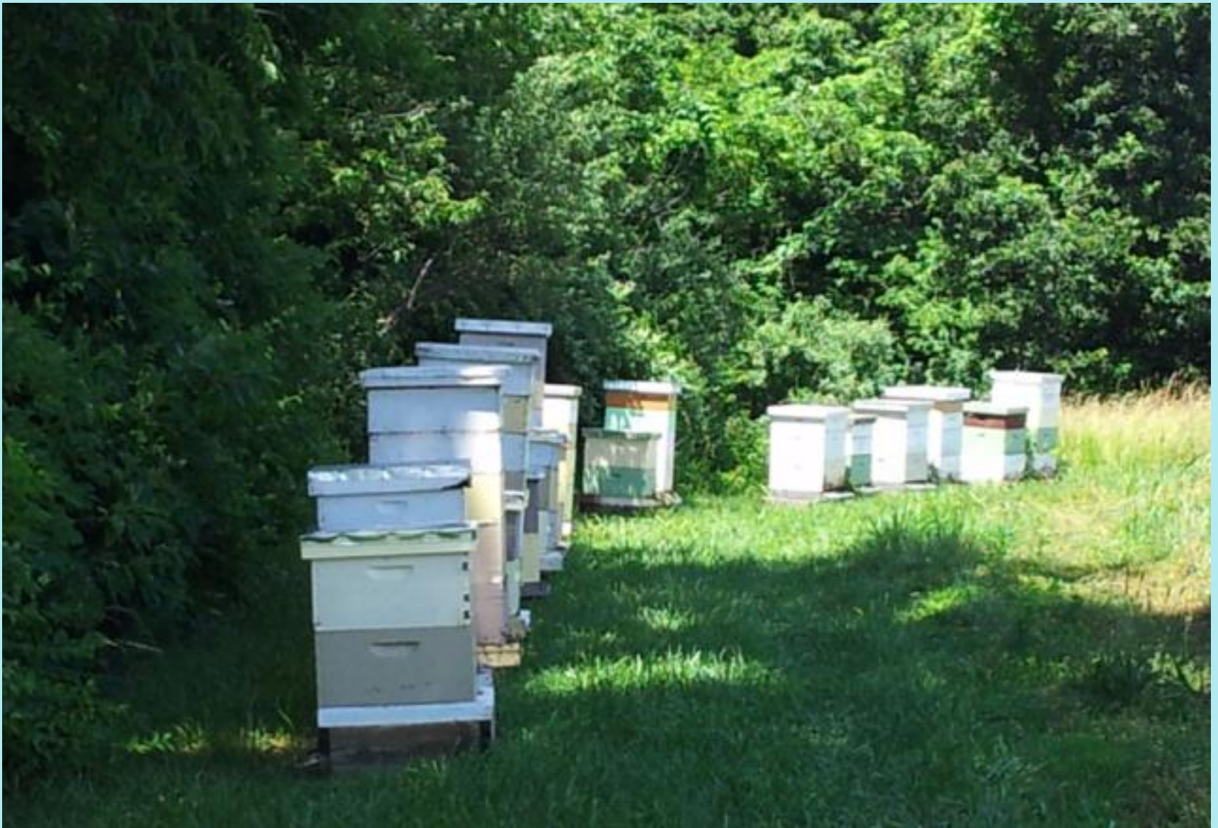
And here is the Beekeeping Area!