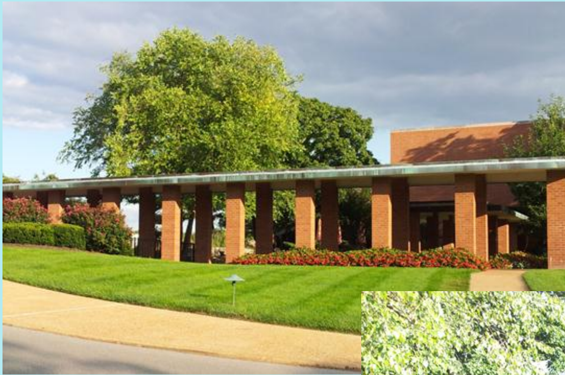
Maritz Travel – McCarthy Plaza