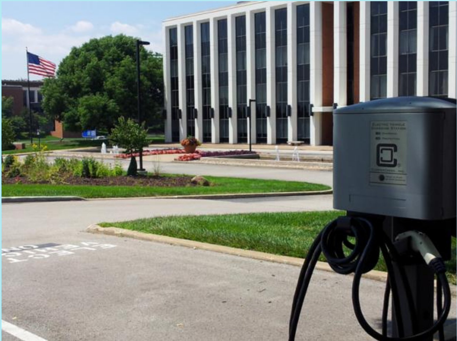
Electric Vehicle Charging Station on our north campus!