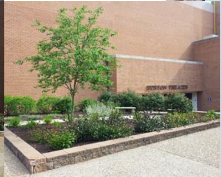
A few other photos from the north side of our campus—Cohen patio area, Burton Theater garden, and Sippy Activity Deck.