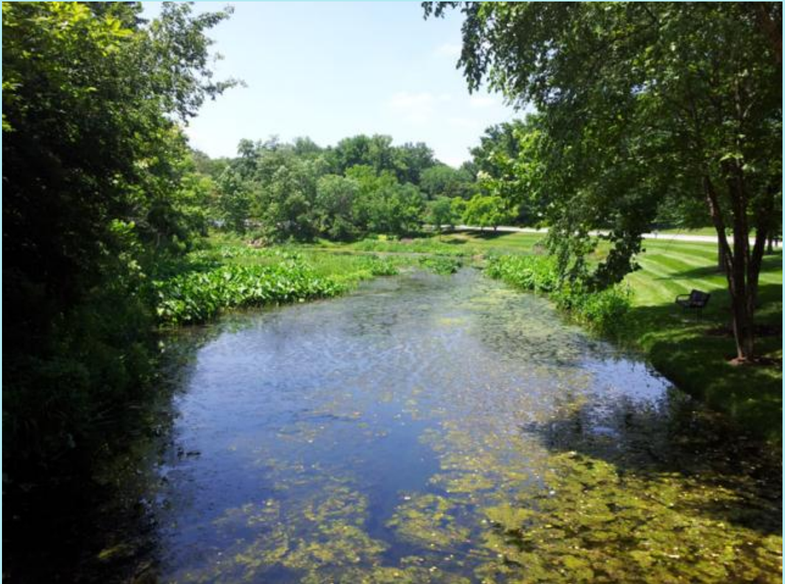
A view of the Wetlands from the patio in July.