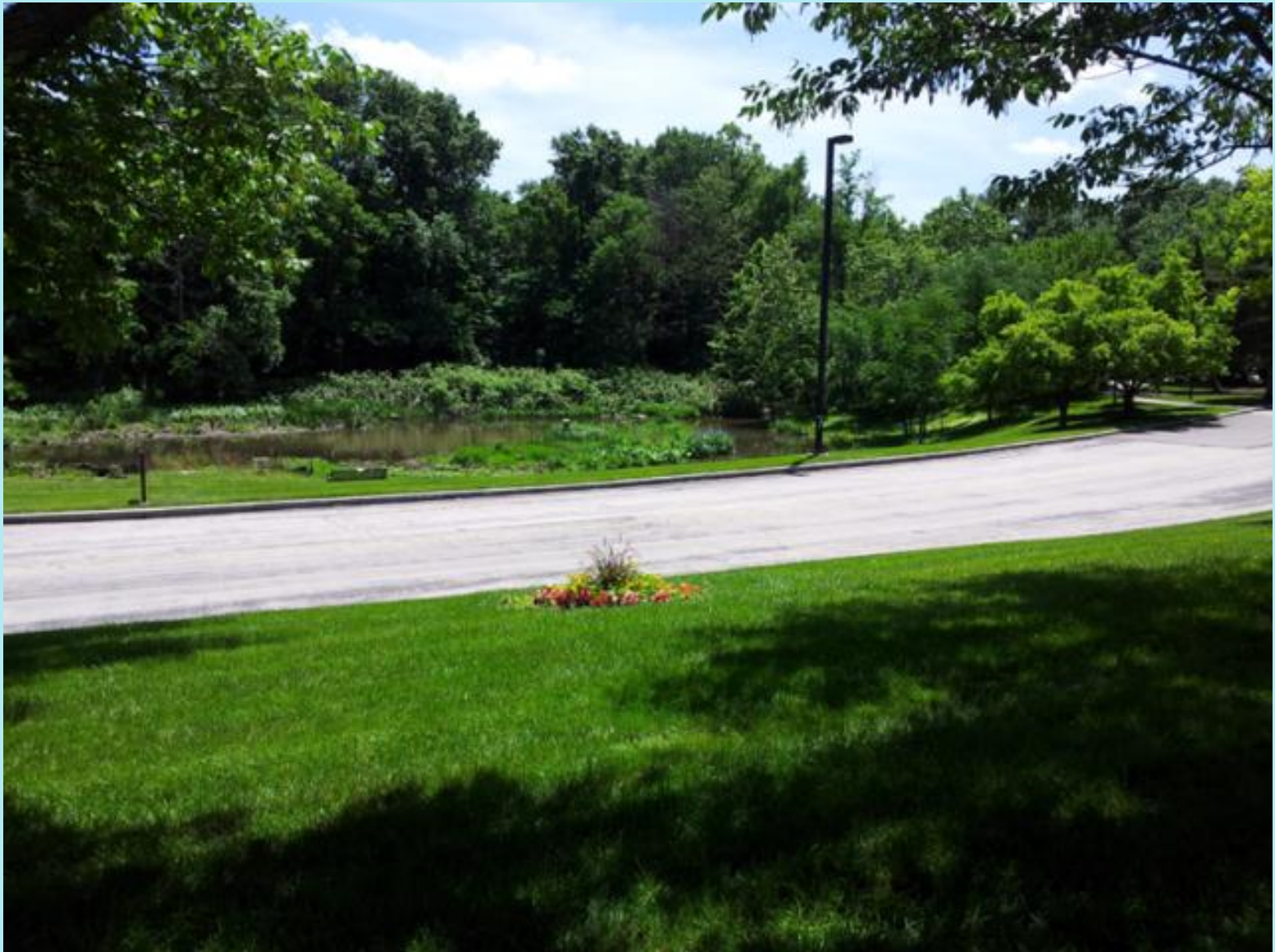
The Wetlands as seen from the path by Founder's Grove.