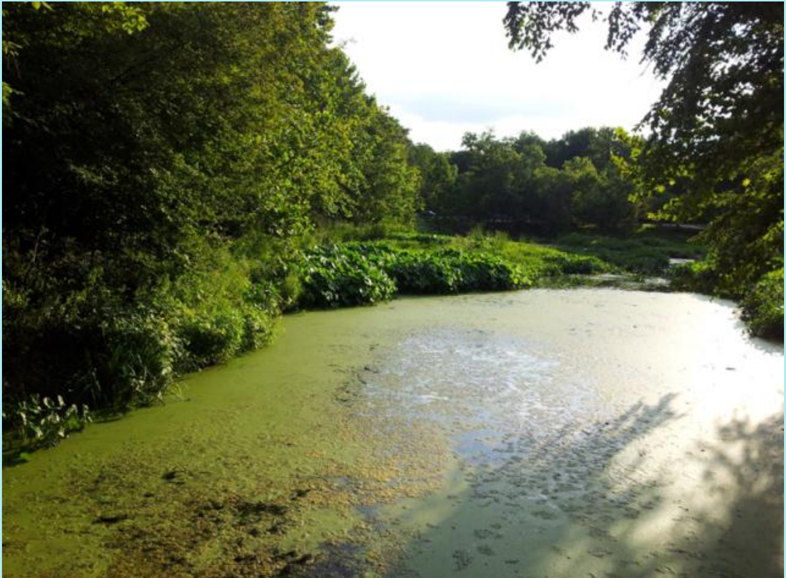
A view of the Wetlands from the patio in August.