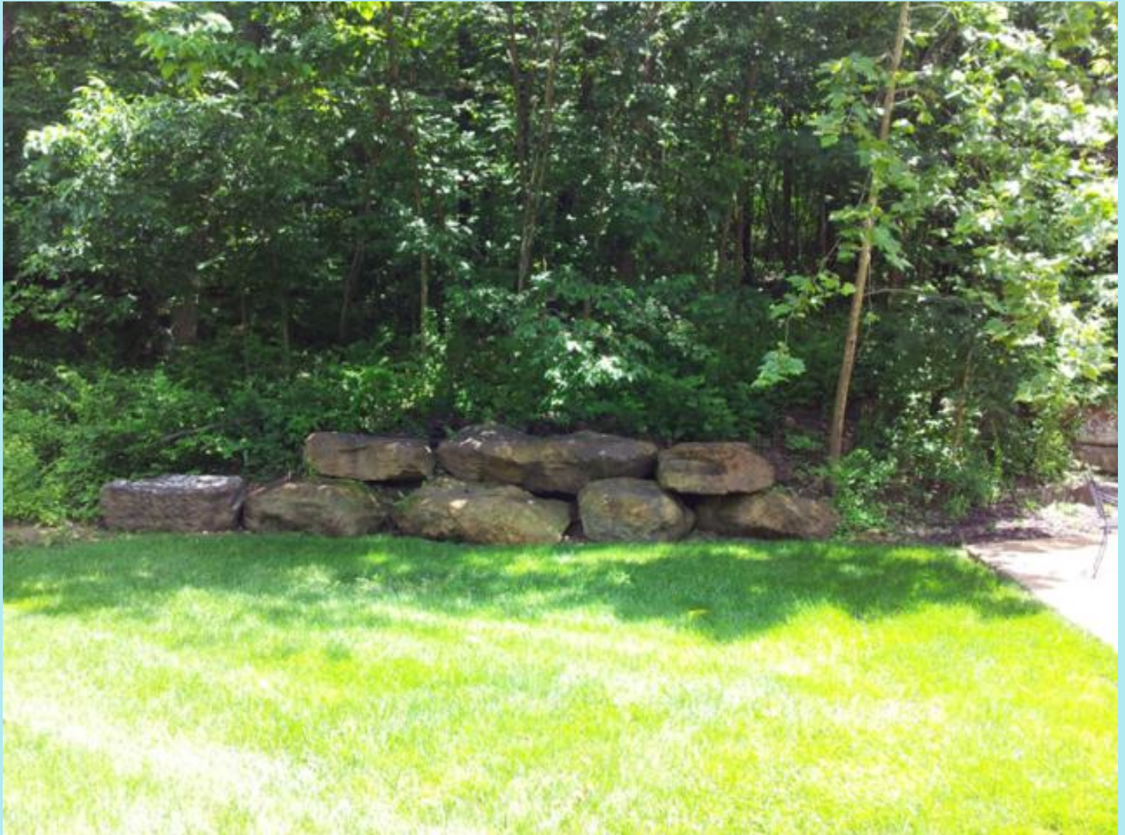
Some natural landscaping by the patio.