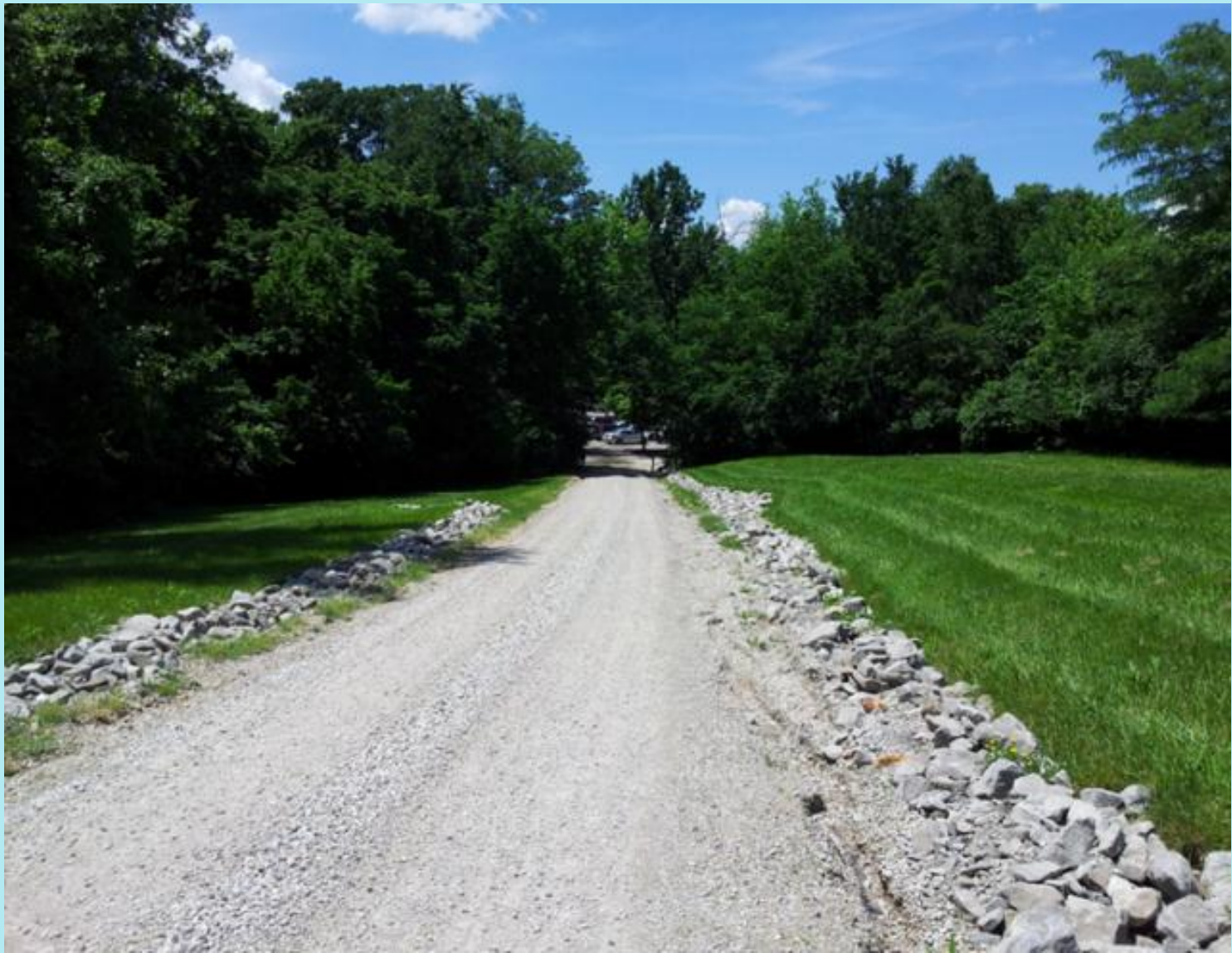
Heading back down the hill towards Yarnell Creek.