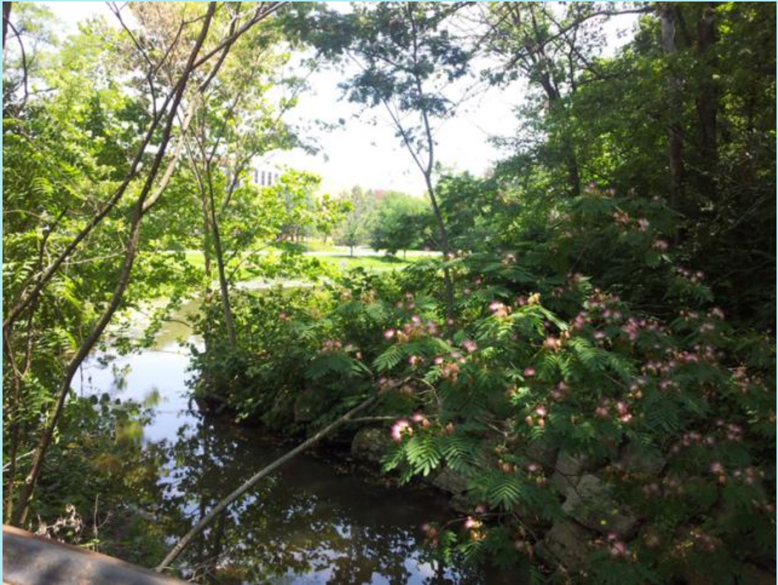
A view of the wetlands from the creek area.