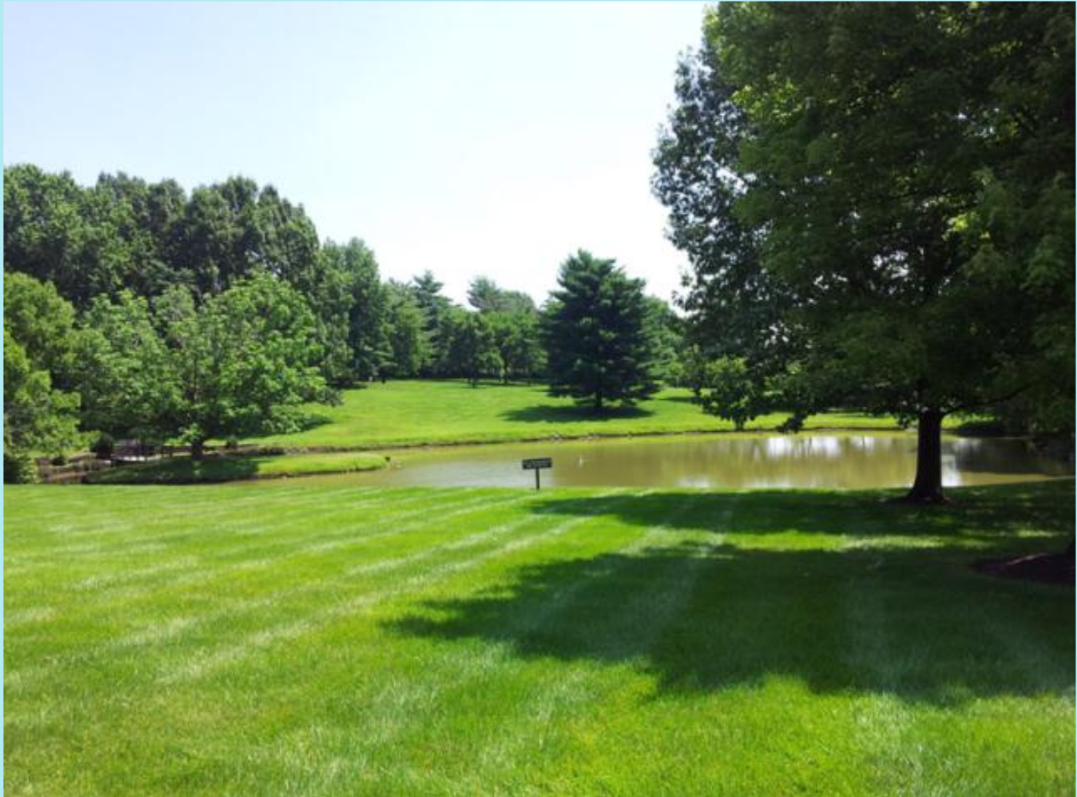
Esther Lake on the north side of our campus.