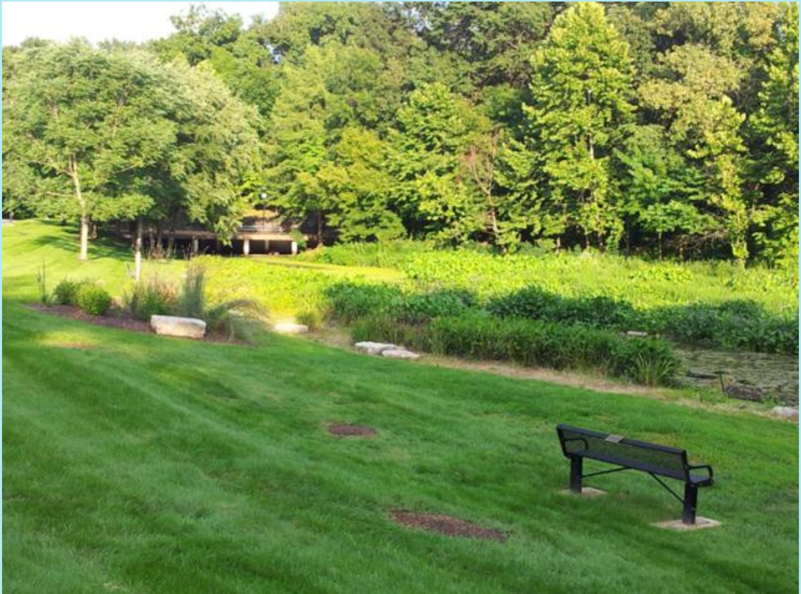
Heading to the Wetlands Patio Area.