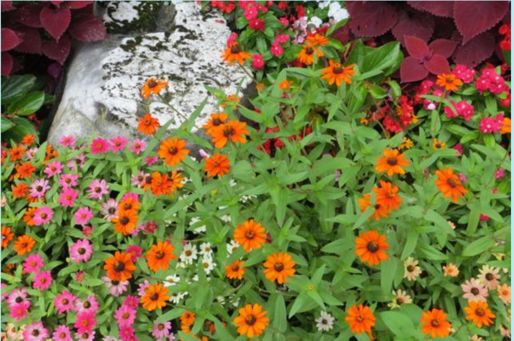
Zinnia Zahara Mix & Redhead Coleus