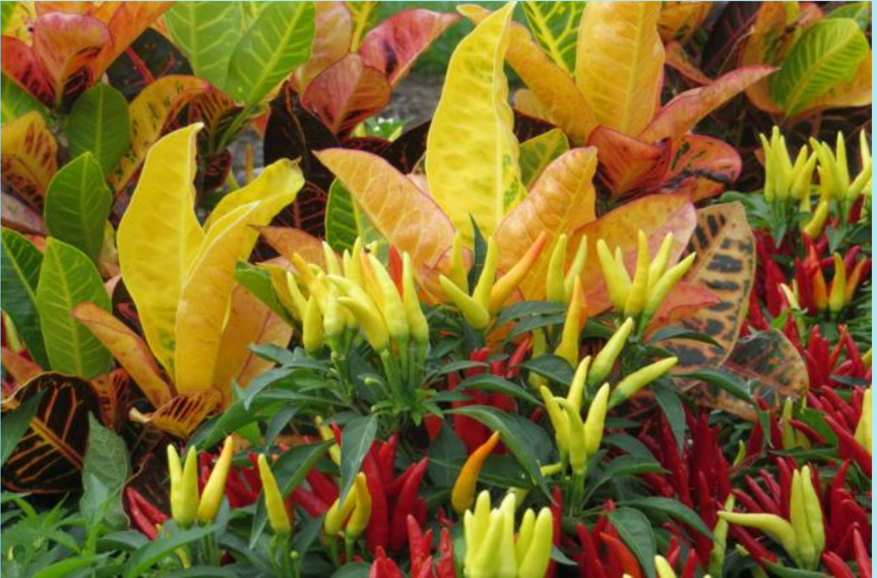
Ornamental Chili Peppers & Croten