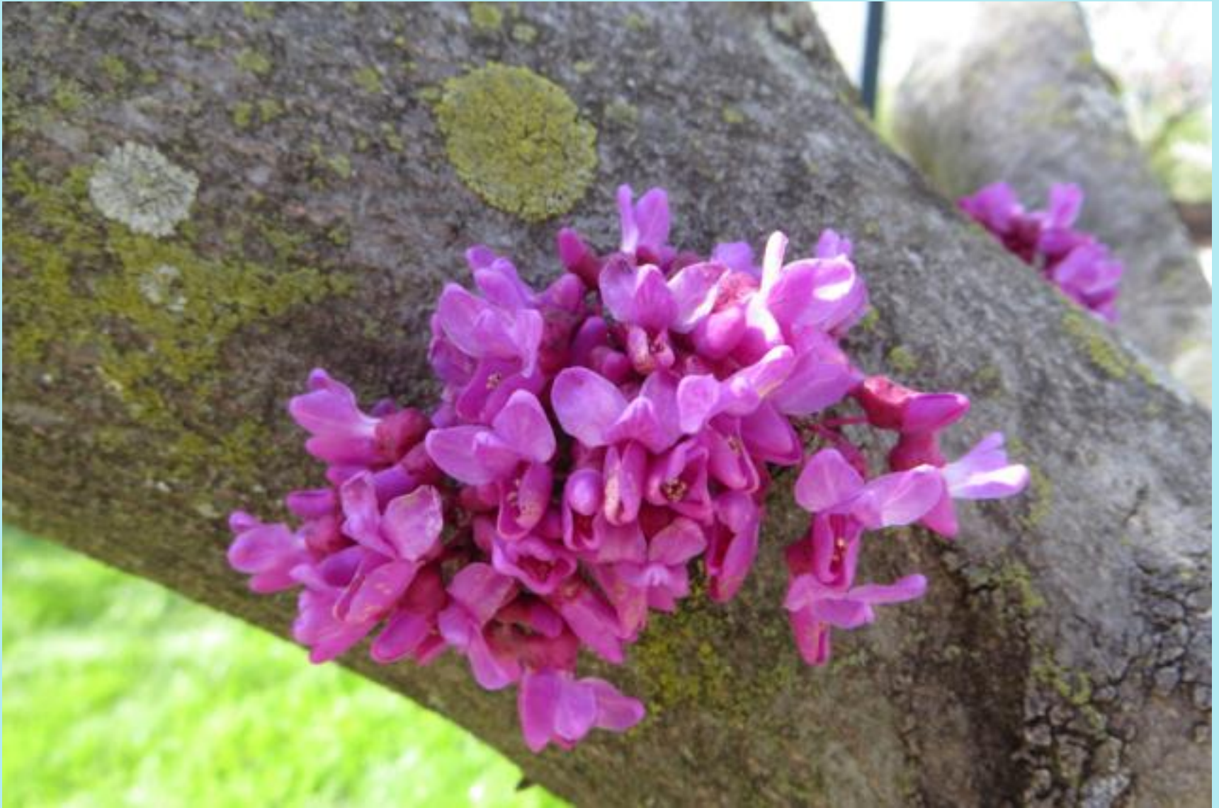
Red Bud Tree with Moss