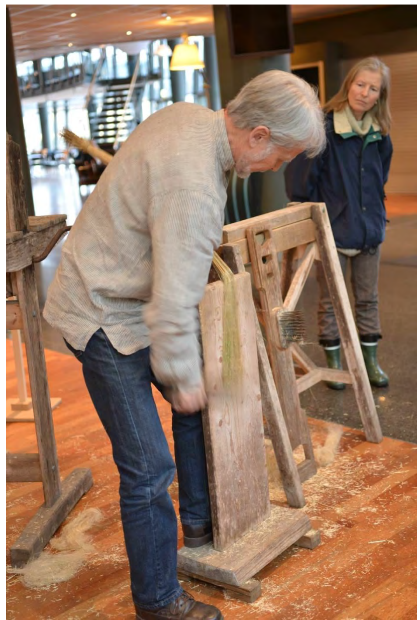
Hand spinning and scutching