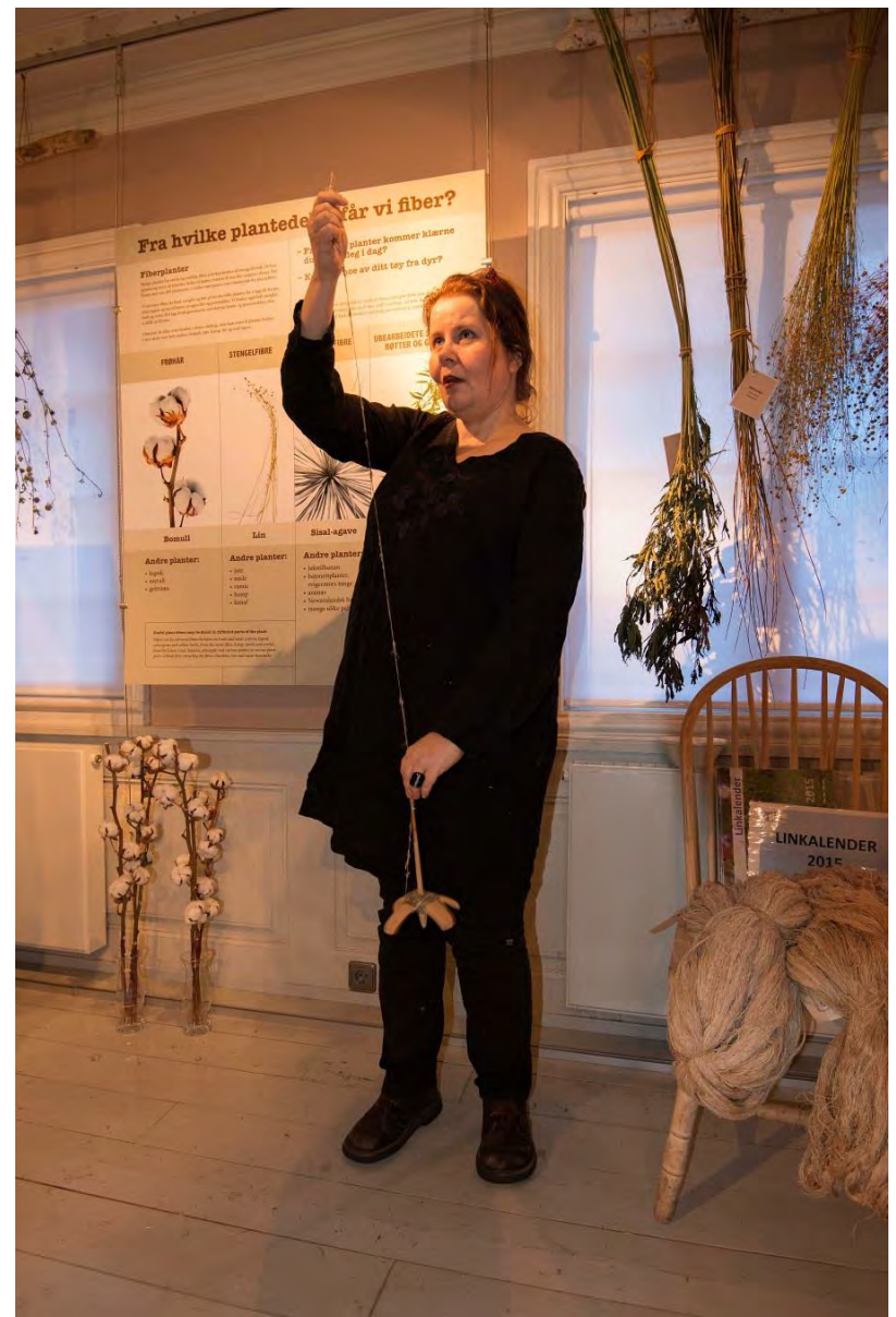
Demonstration of different methods of spinning flax