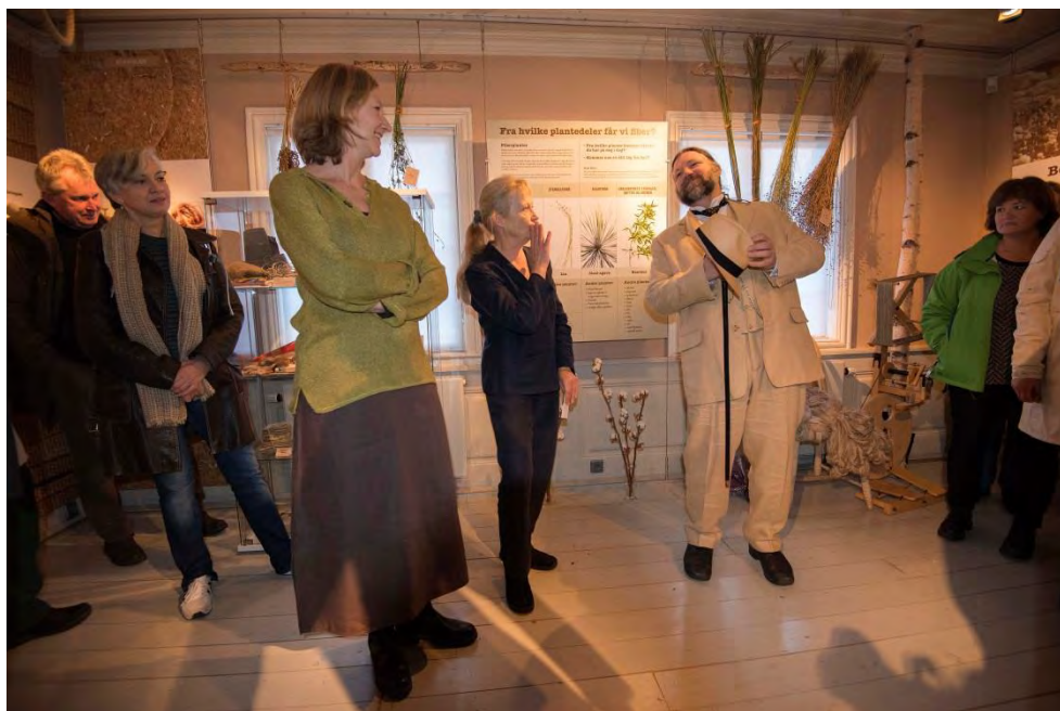
The opening event