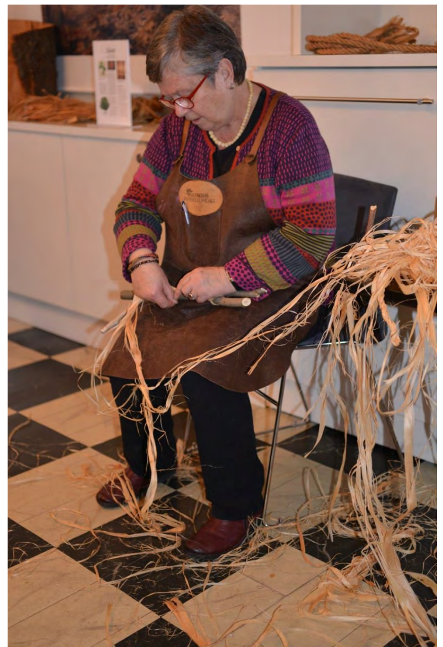
Rope making of Tilia cordata (lime)