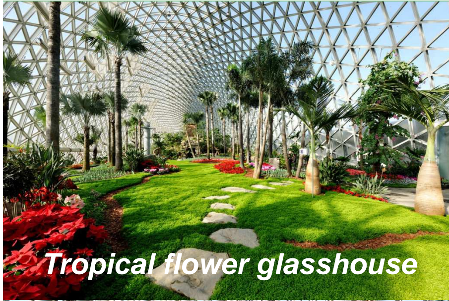
Tropical flower glasshouse