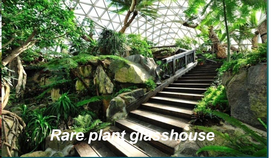
Rare plant glasshouse