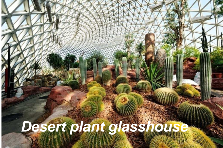
Desert plant glasshouse