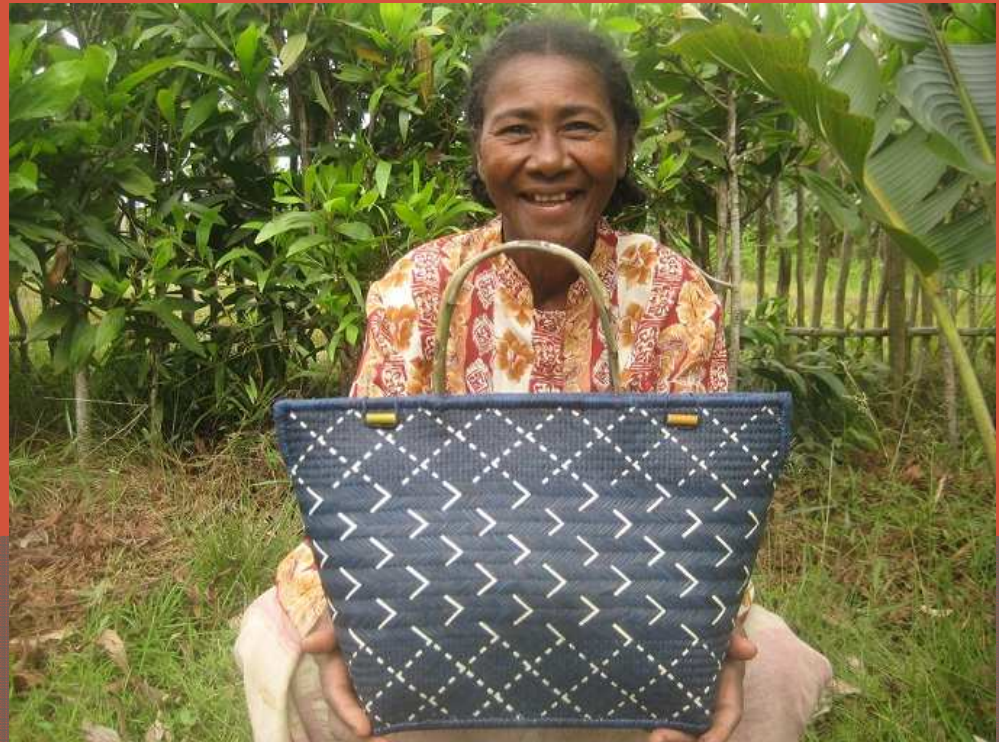
Styles of basket of the Blessing Basket Project