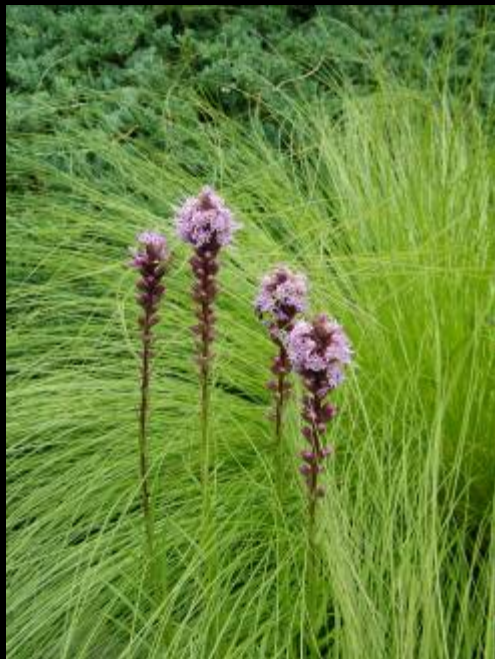
Marsh Blazing star