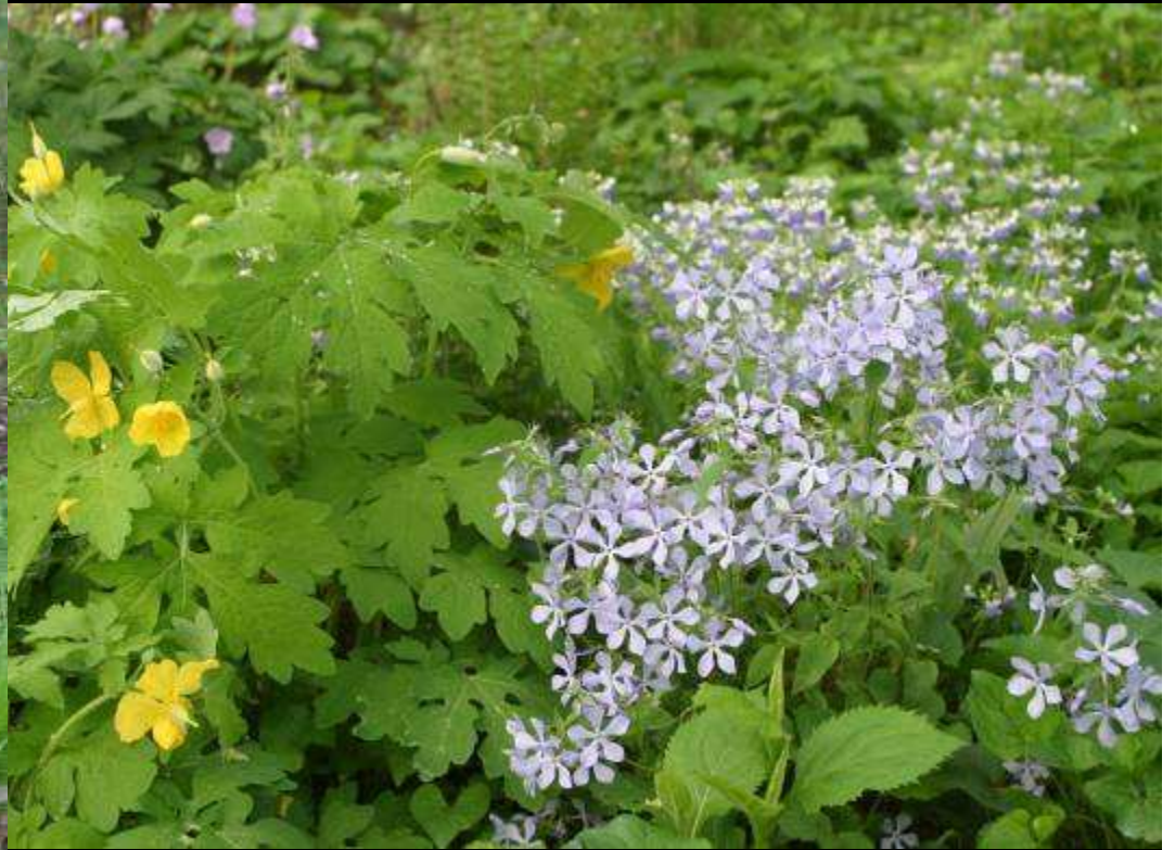
Wood Poppy and Wild Sweet William...No