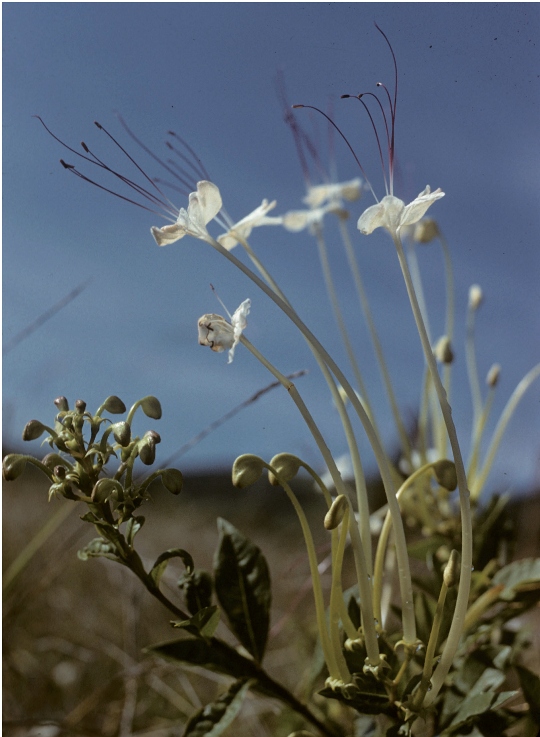
Fig. 2. – Living plant of Rothea microphylla (Blume) Callm. & Phillipson.