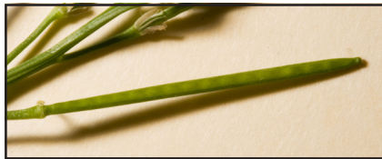
Fruit 1.5–2.5 cm × 1–1.4 mm, often appressed.