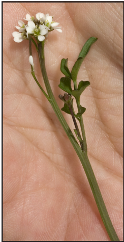
Inflorescence and stem leaf.

Petals 4, 2.5–4.5 mm, white; sepals 4, 1.5–2.5 mm; stamens 4; ovary 1, style 1. Apr 11–June 1.