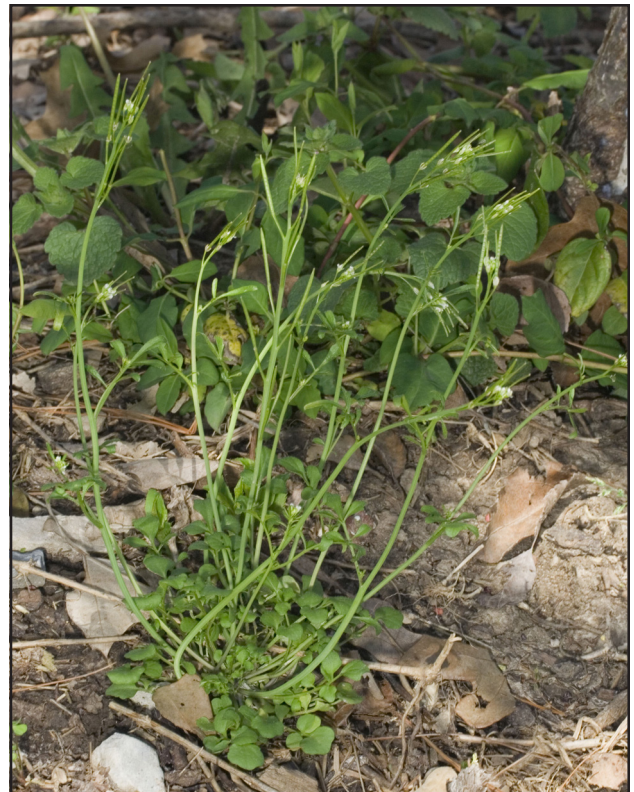
Annual herb to 0.4 m. Wide variety of habitats.