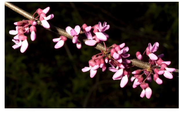
Inflorescences small clusters of flowers forming on branches or trunk, pedicels to 1.2 cm.