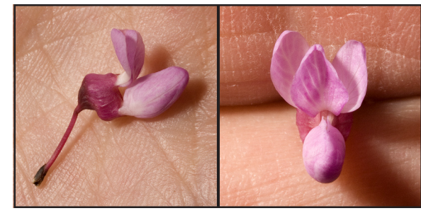
Petals 5, 8-10 mm, deep purplish pink (white); calyx irregularly 5-toothed; stamens 10; ovary 1, style 1. Blooms Apr 18-May 27.