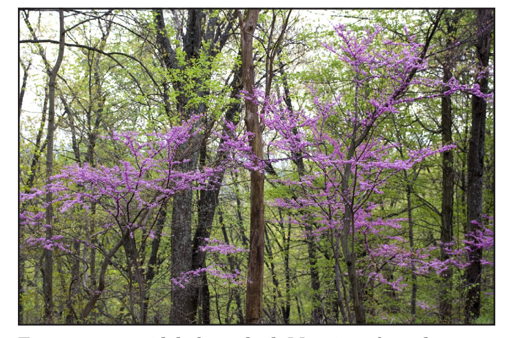
Tree to 12 m, widely branched. Margins of woods.