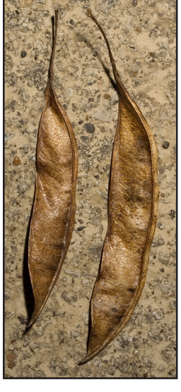
Fruit a pod, pointed at both ends, 6-10 \times 1–1.5 cm.