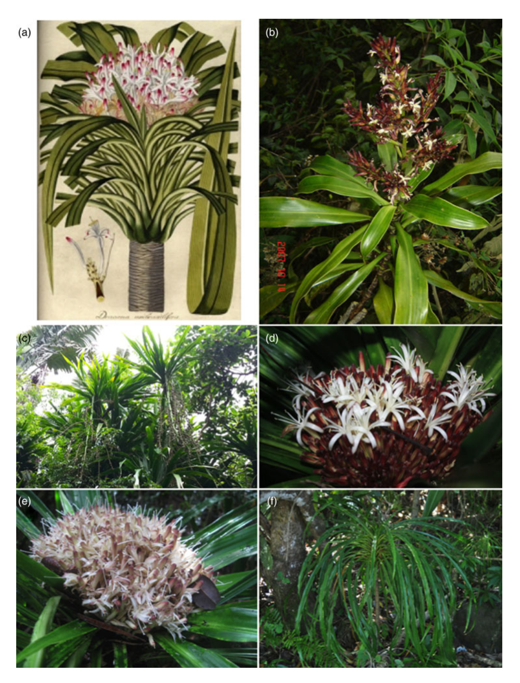
PLATE 1 (a) The original illustration of Dracaena umbraculifera from Jacquin (1797), (b) a paniculate inflorescence of Dracaena reflexa in Madagascar (photograph by P. Antilahimena, collection number 5824), (c) a diffuse paniculate infructescence of Dracaena floribunda in Mauritius (photograph by C. Edwards), (d) a young inflorescence of D. umbraculifera in Ile Sainte-Marie (photograph by Rova Malala Rakotoarivelo), (e) an inflorescence of D. umbraculifera in Ile Sainte-Marie in full flower (photograph by A. Lehavana), and (f) a vegetative individual of D. umbraculifera (photograph by P. Lowry).

distinctive morphology, with tightly clustered flowers in a nearly umbellate inflorescence in the centre of the leaves (Plate 1a), differing from the diffuse, paniculate inflorescences that characterize all other Dracaena (Plate 1b). Although Jacquin indicated that the cultivated plant on which he based his description came from the island of Mauritius (Jacquin, 1797), its origin is unclear. It may have been collected during a voyage made by Franz Boos and Georg Scholl, who sailed to South Africa and Mauritius during 1786–1787 and sent back 280 cases of plants, assembled by M. Céré of the Pamplemousses Botanical Garden in Mauritius. However, there is no surviving documentation of the plants contained in this shipment nor is it known whether they were all Mauritian natives. Dracaena umbraculifera is not