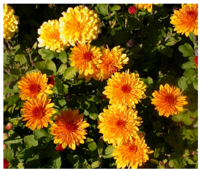
Chrysanthemums come in many varieties today.

Pyrethrum is made from a Chinese flower, the chrysanthemum. The crushed flowers and oils were used during wars through the 1800s to keep bugs, like fleas and head lice, off of the soldiers. However, the insecticide did not last long in the sun. Today, because it is often mixed with other substances, it may not be as safe to use.