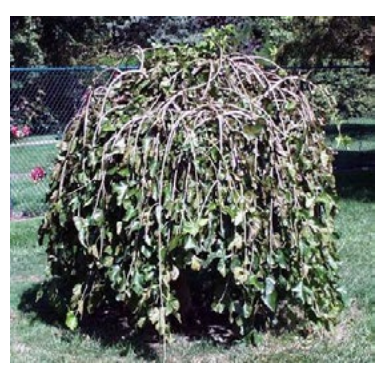
A dwarf white mulberry

In China, the white mulberry ( Morus alba ) grows in rich soils and part to full sun. It is a strong, fast growing tree that can grow as high and wide as