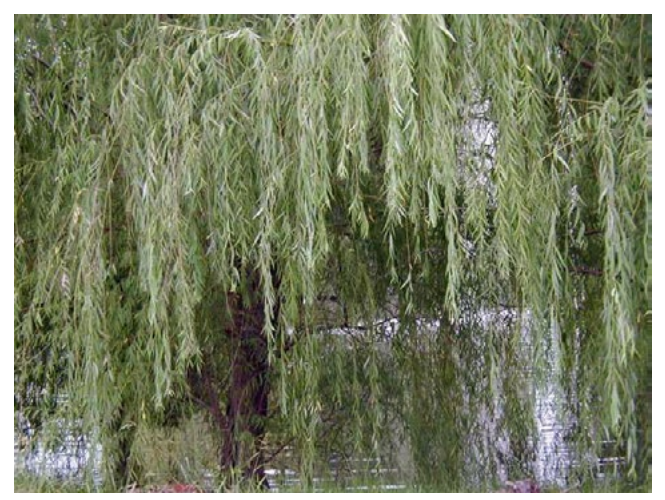
Weeping willow (origin: China)

More important is the medicinal value of the willow. The bark has a compound called salicylic acid which is used to make aspirin. It is also used to make medicines that act as anti-inflammatory agents. Salicylic acid is used to reduce heartburn and treat bleeding in the arteries.