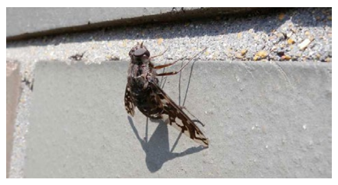
Bee Fly ▲ Bee fly adults are interested in pollinating, not people.