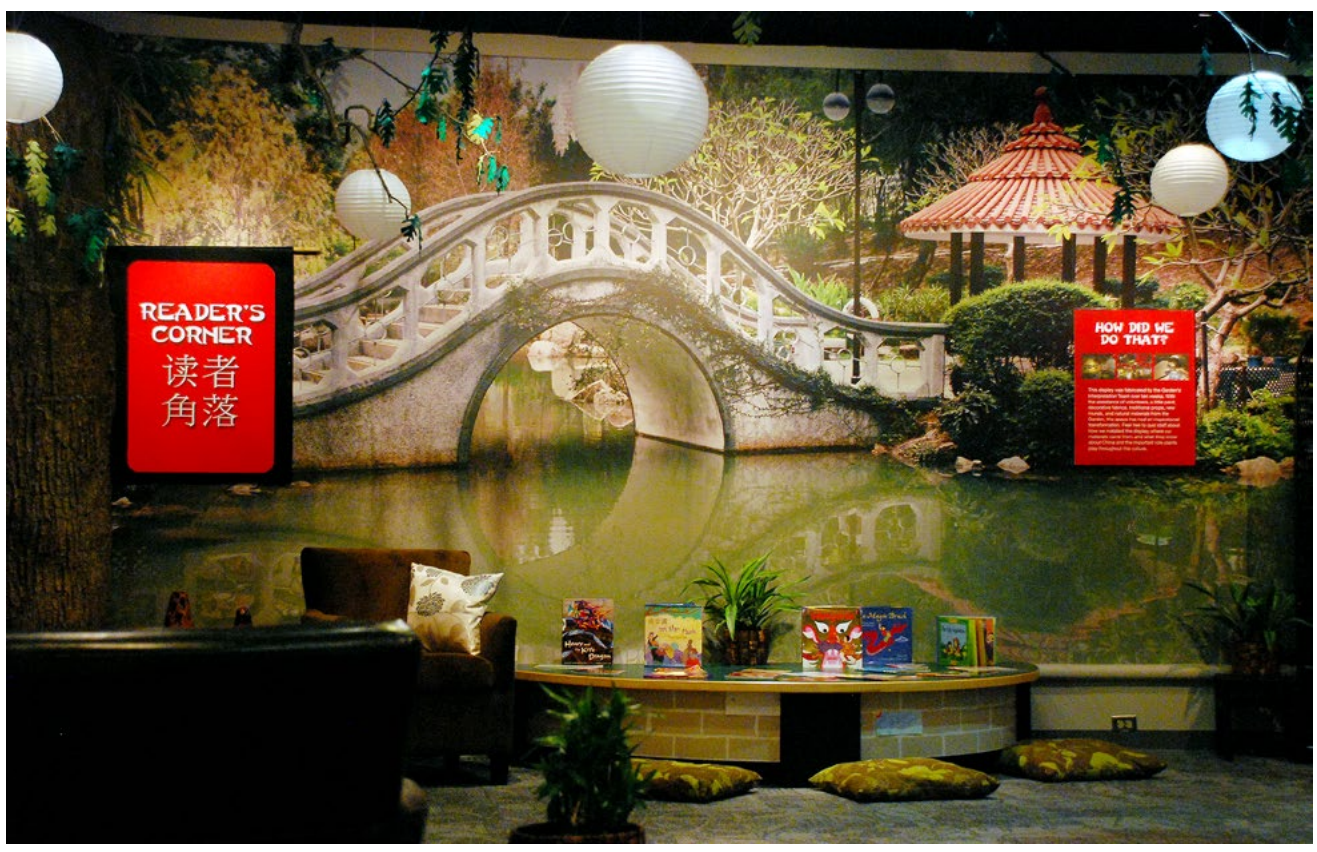
Plants and People: China exhibit

The exhibit is located in the Brookings Interpretive Center at the Missouri Botanical Garden. It is on display March 31, 2012 through January 1, 2013.