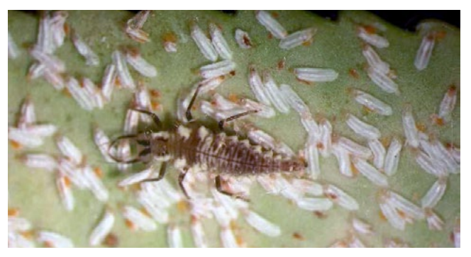
Lacewing Larva ▲ Lacewing larva are small white organisms that feed on leaf scale.