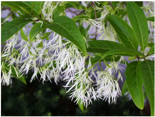
Chinese fringe tree blossoms

When in life's thunderstorms, may you be Under the fringe tree, not on the fringe. [Chinese fringe tree]