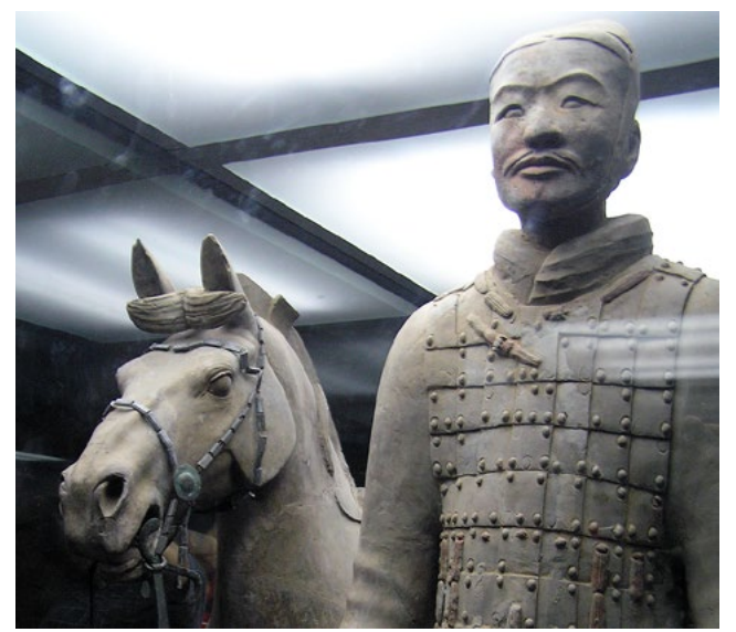
Terracotta warrior and horse on display in a museum

About 40 years ago, a set of life-sized clay terracotta warriors were discovered in China. The first emperor of the Qin dynasty had these warriors created around 200 BCE. The 8,000 warriors were painted and have individual facial features. Horses, chariots, and larger than life generals were found. Upon excavation, exposure to the oxygen in the air—after so many years of being covered and protected from wind, water, and fluctuating temperatures-caused the painted surface on the warriors to fade and flake off. After almost 2,200 years of being buried, the warriors began to weather. Today some of these warriors remain buried to protect them and others have been brought into museums that are climate-controlled to protect them. These warriors are one of the most popular tourist destinations in China.