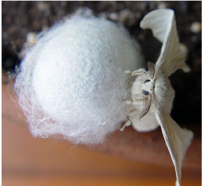
Silkmoth and cocoon

Most moth and butterfly larvae make silk, but only one silkworm larvae ( Bombyx mori ) makes a silk that is of commercial worth. When the silkworm makes its cocoon , it is spun from one thread almost a mile long. If the silkworm was allowed to live, the silk would be worthless, so