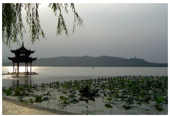
West Lake in Hanzhou

It has a 1,400-acre lake (your school and playground may take up the space of one acre) that is only five feet deep and shaped by silt that once settled here. Mountains rise in the distance. People on one of the human-created islands in the lake light lanterns at night similar to the Lantern Festival. When walking by the lake, the sweet aroma of tea comes down from the mountain. A Grand Canal, larger than the Suez Canal, was built to connect Hangzhou to Beijing, making it the longest human-created waterway in the world. Hangzhou is known for its fish, fruits,