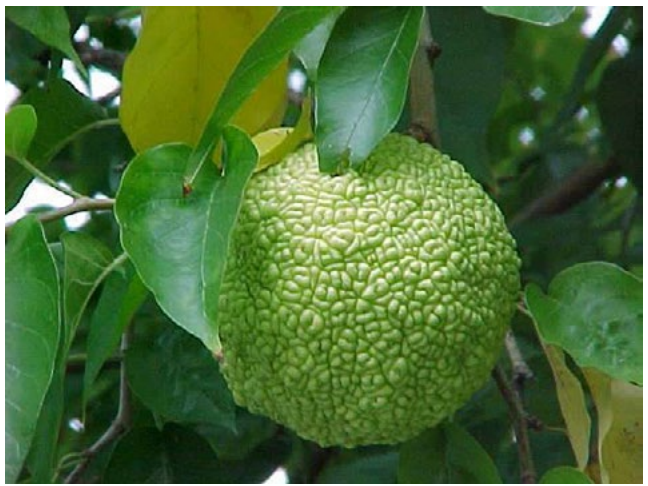
Silkworms can also survive by eating the leaves of the Osage Orange (Maclura pomifera), a tree native to Missouri.

Silk is a wonderful fabric for dyeing. Highlight that the silkworm (a moth larvae, not a worm), by eating the leaves of the mulberry tree, creates its cocoon and it is the silk that made the cocoon that is valuable for making thread and then the thread is spun into silk cloth.