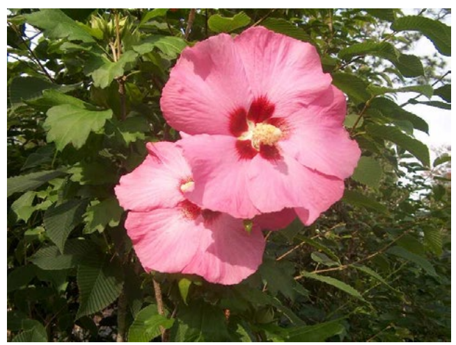
Rose of Sharon/hibiscus

• Rose of Sharon/hibiscus: red, pink, or white blossoms; blooms in summer.