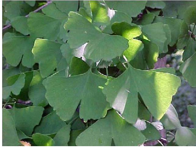
Leaves of the ginkgo tree (origin: China)

Students will learn about the aspects of interviewing, such as eye contact, body posture, and clarity in delivery of questions. The students will learn about the use of a warm-up question and the use of open-ended questions that will provide the most information from a person being interviewed. Students will practice together, so that they may develop a few probing questions for follow-up. Students will develop questions that garner descriptive rather than yes/no answers.