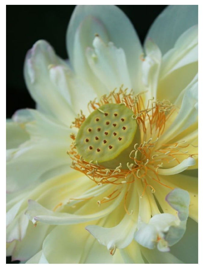
Sacred lotus flower