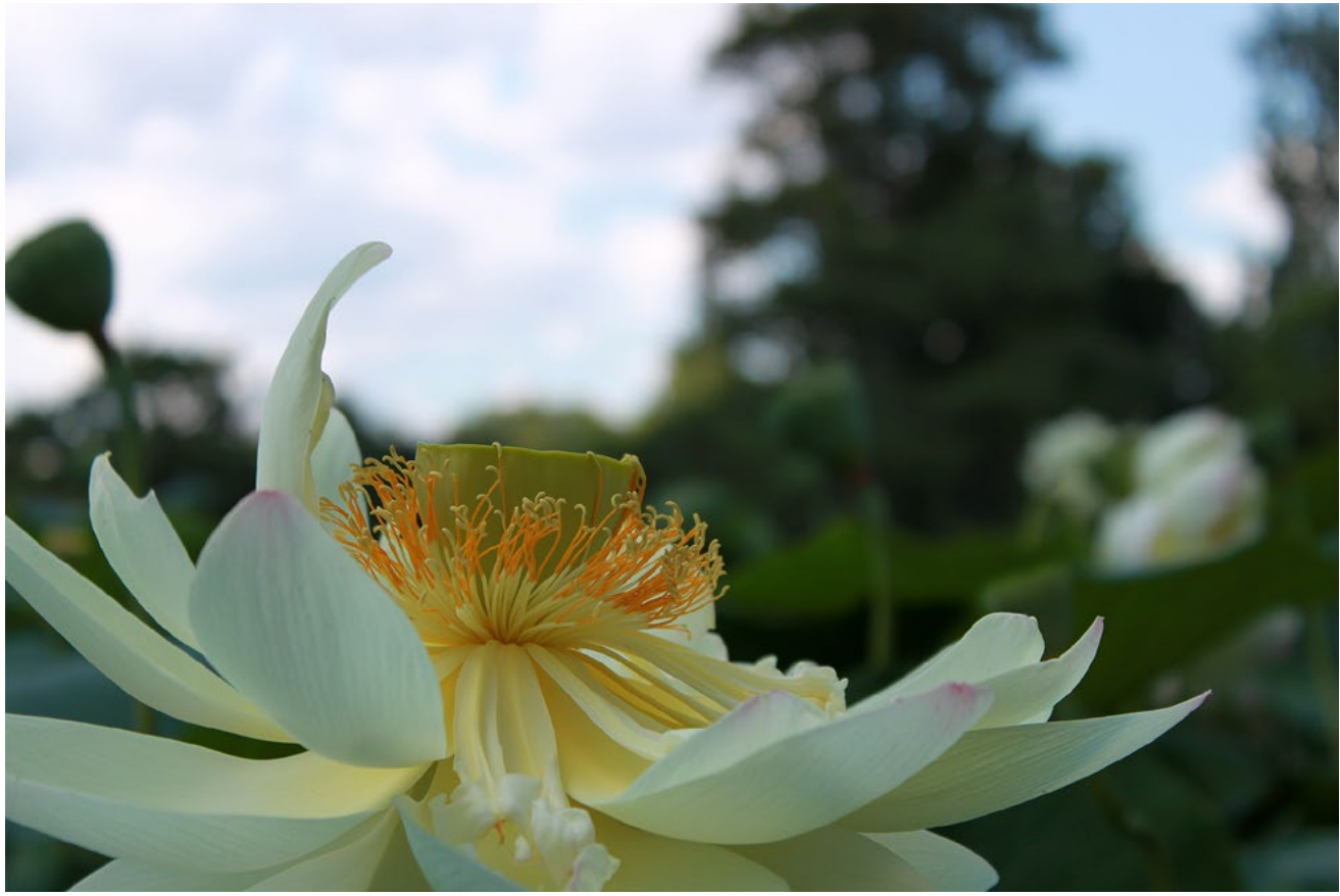
Sacred lotus