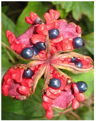
The peony is an example of a plant species native to China and introduced into the U.S.

Assign students one of the plants in their schoolyard and a plant that is native to China and introduced to the United States (see table on page 42). They can begin by looking up their plants on the Missouri Botanical