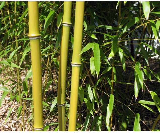
Bamboo (origin: China)

Bamboo ( Bambusa spp) is easy to work with because it is lightweight and thin; however, it is a very tough tree. Bamboo is so tough that it was historically used for bridge building in remote areas. It is used extensively in construction of furniture, flooring, and fences, pillars, in the building of boats, instruments, and boxes. People can wear it and ages ago, people wrote on it.