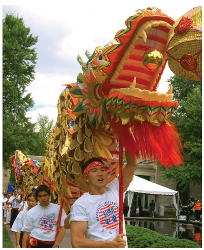
Chinese dragon parade

The Chinese Zodiac's Fifth Sign: the Dragon It is believed that the Chinese Zodiac was