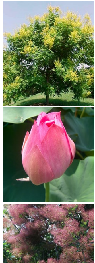
Golden rain tree (top); lotus (middle); smoketree (bottom)

plants represent about eight percent of the world's estimated total of ca. 400,000 species. This compares with some 19,500 in the U.S. and Canada combined and about 12,500 in Europe. Moreover, approximately 51 percent of the species in the Chinese flora are endemic (grow nowhere else on Earth as wild plants). This means that one in 25 of the world's plant species are found in China. Infor-