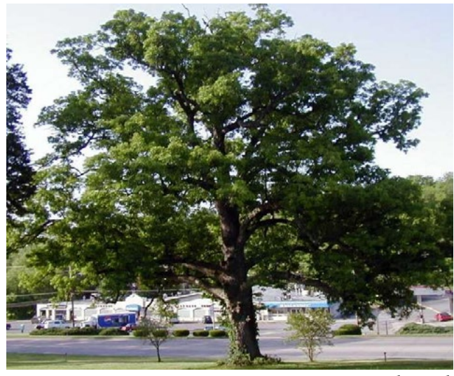
White oak (origin: U.S.)