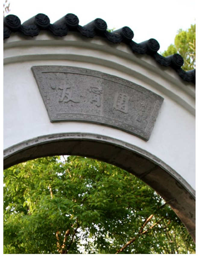
Pendulous Lotus Gate, Margaret Grigg Nanjing Friendship Garden

The garden's surrounding walls have a "dragon ripple" configuration with inset ornate windows. These windows are the "eyes" of the garden allowing the visitor to look out upon a grove of bamboo just beyond the southern wall. The designer of the garden has carefully chosen traditional plantings, many of which have spiritual significance or value in Chinese culture. Plantings include pines, bamboos, willows, plum trees, forsythia, hibiscus, wisteria, peonies, lotuses,