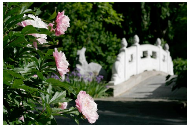
Peonies in Margaret Grigg Nanjing Friendship Garden

China is vast in geographic scope, from the variety of landforms to the varying climates of the different regions. China has more plant species than almost any country in the world and has contributed beautiful, economically useful and nutritious plants to the U.S. Every lesson in this guide speaks about or includes plants. All lessons correspond to content area grade-level standards for Missouri for the grades listed. Many of the hands-on activities can be conducted over multiple days, in or outside of the classroom.