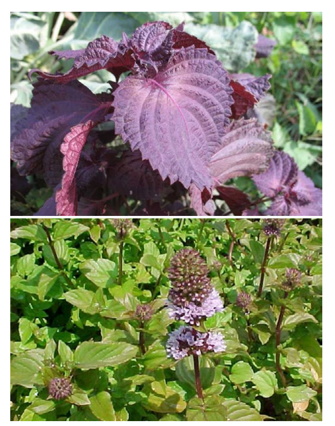
Perilla frutescens (top) and Mentha sp. (bottom)

Once dry, you can make sachets out of the dyed silk cloth. Use these Chinese spices and herbs for the sachet: dried perilla (can be invasive in this region), cassia, or cinnamon, peppermint, star anise, dried ginger, etc.