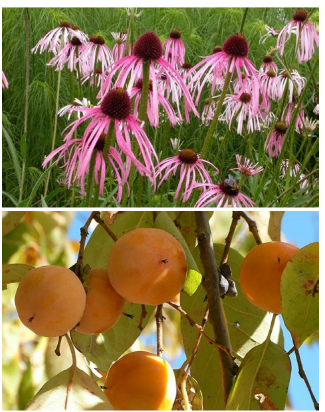
Pale purple coneflower (top); persimmon tree (bottom)

• Older students can use math to calculate a density count. In this way, they can identify