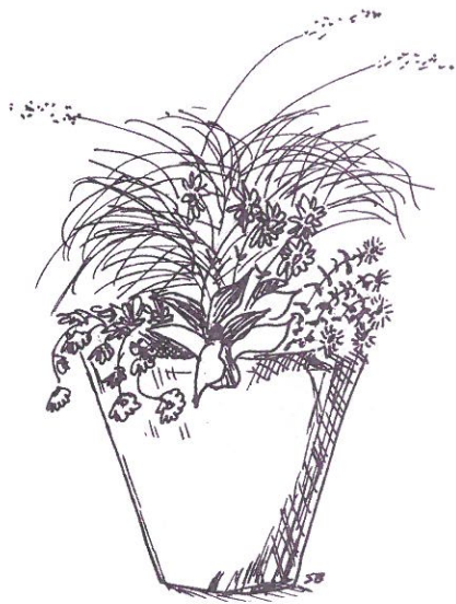
Container Design D