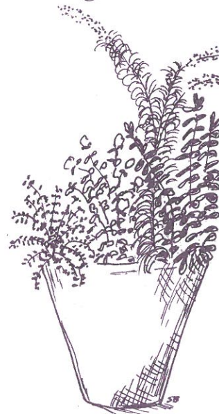
Container Design E

Southern Prairie Aster ( Aster paludosus )