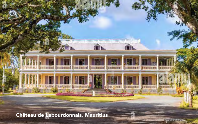
Château de Labourdonnais, Mauritius

To reserve a place, please call Arrangements Abroad at 212-514-8921 or 800-221-1944; email: trips@arrangementsabroad.com ; fax: 212-344-7493; or complete and return this form with your deposit of $1,000 per person (of which $500 is non-refundable for administrative fees) payable to Arrangements Abroad . Mail to: Arrangements Abroad, 260 West 39th Street, 17th Floor, New York, NY 10018-4424.