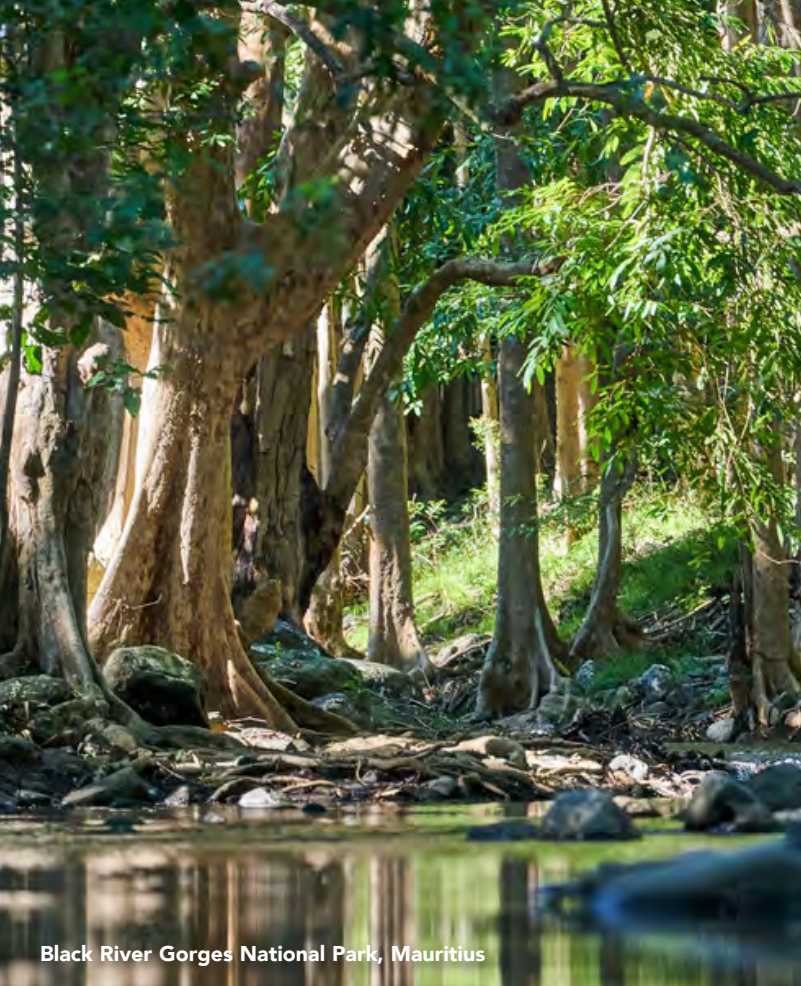
Black River Gorges National Park, Mauritius

Next, join an expert for a guided tour of Black River Gorges National Park , the largest protected forest in Mauritius. This vast 67-square-mile sanctuary preserves the last remnants of Mauritius's native forests. Traverse its mist-shrouded trails, discover hidden waterfalls, and keep an eye out for the Mauritius kestrel, which has been brought back from the brink of extinction here.