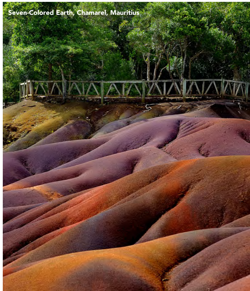
Seven-Colored Earth, Chamarel, Mauritius

Meet with members of the Mauritius Wildlife Foundation for an inside look at their ambitious ebony forest restoration project in Chamarel , where they've reintroduced more than 141,000 native plants as well as endangered species like the pink pigeon and echo parakeet.