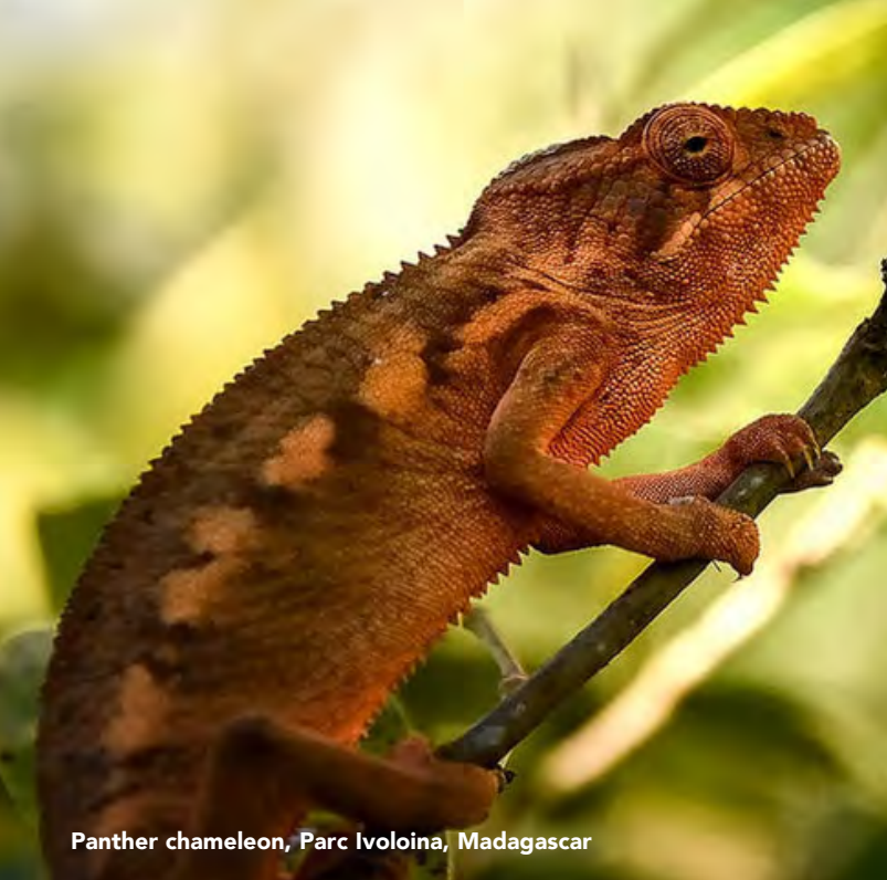
Panther chameleon, Parc Ivoloïna, Madagascar