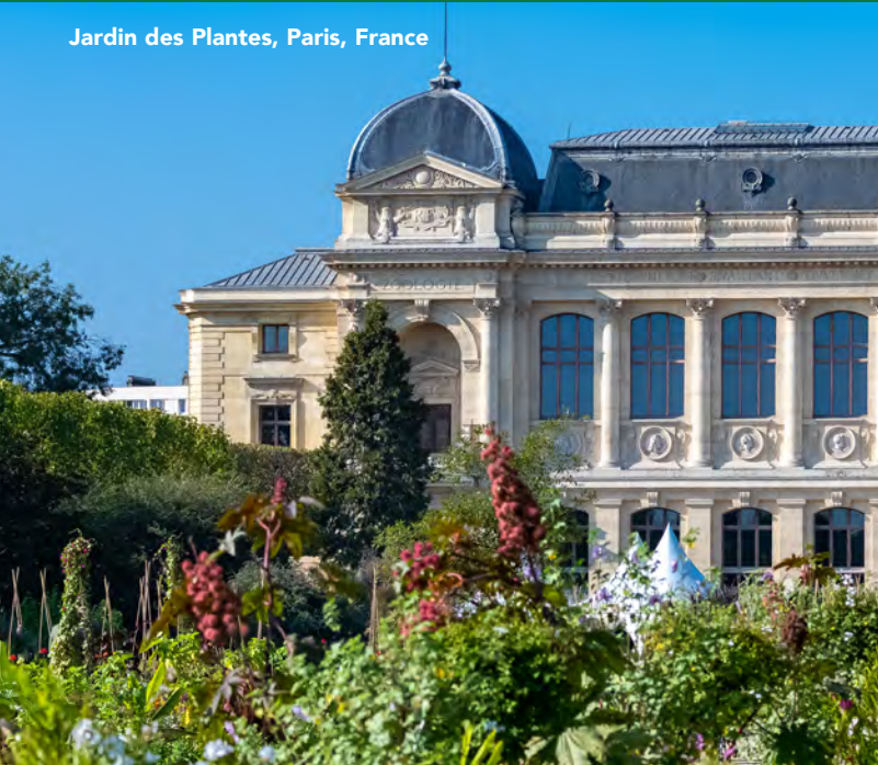
Jardin des Plantes, Paris, France