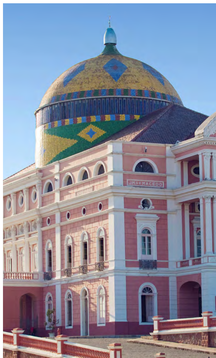
Teatro Amazonas, Manaus

This morning, return to Manaus via boat and check into the Hotel Villa Amazônia . In the afternoon, take a privately guided tour of the Teatro Amazonas , a remnant of the city's brief rubber boom from 1896. Admire this Renaissance Revival opera house, its dome covered in 36,000 glazed ceramic tiles. Inside, view its collection of Louis XV furniture and Italian marble stairs.