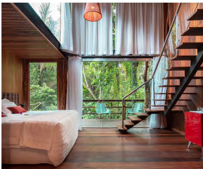
Mirante do Gavião Amazon Lodge, Novo Airão