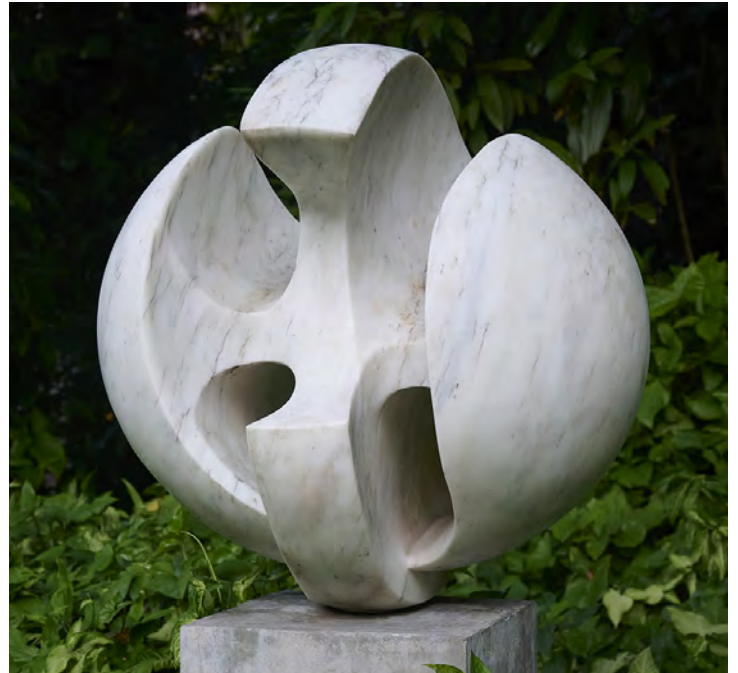
Bruno Giorgi, Passaro , 1969, Museum Casa Roberto Marinho