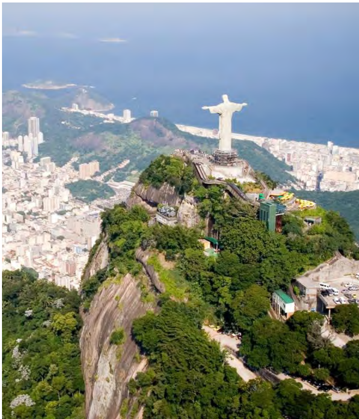
Rio de Janeiro

Gather for drinks and an early dinner at a scenic location. B,L,D