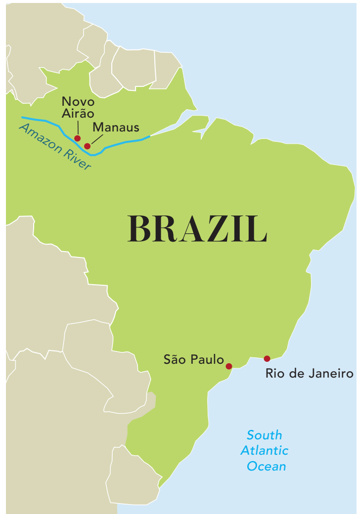
Map of the region