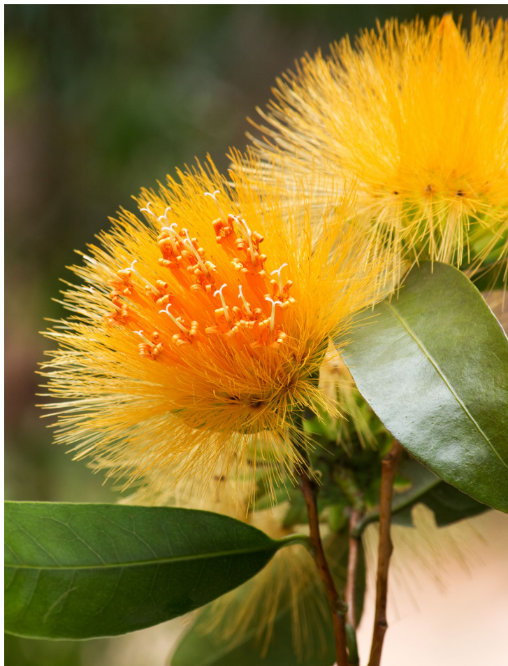
Yellow Estívia, São Paulo Botanical Garden

Begin the day at the São Paulo Botanical Garden , established in 1928, and walk through native forest growing on the acidic soils of the São Paulo Plateau. The orchidarium holds one of South America's oldest and most significant collections, functioning as a genetic repository for threatened species.