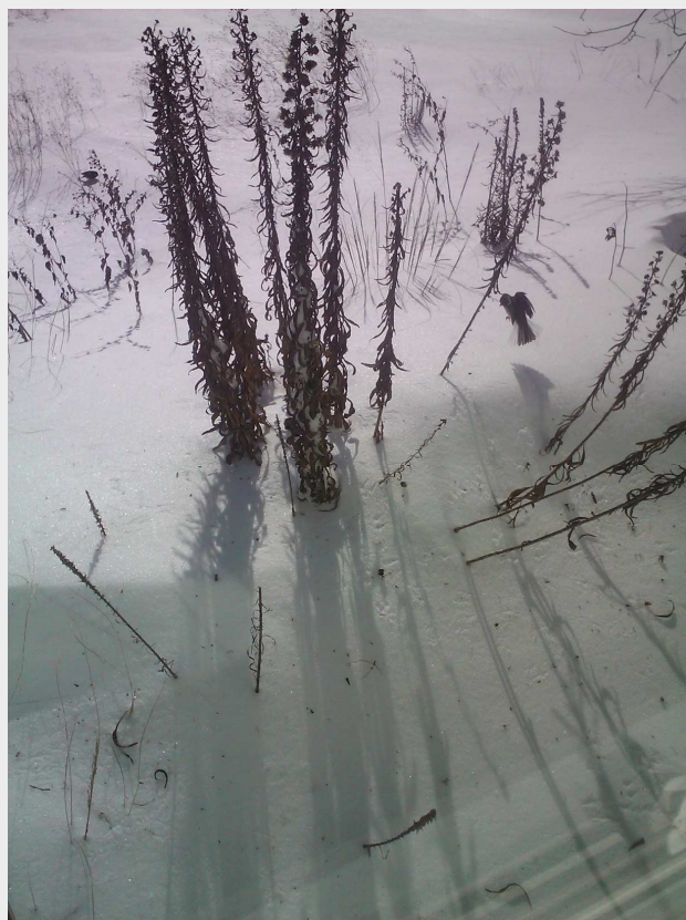
A junco jumps up from the snow to peck seeds from eastern blazing star on a cold winter day.

The practice of putting the garden to bed may be a death sentence for overwintering insects and birds. Insect pupa exist on and inside plant stems and leaves and provide food to birds. Stems that hold seed off of the ground in winter, like many native perennials, grasses, shrubs and trees also provide critical food to winter birds, especially when snow is on the ground covering most seeds. The seed and insects remaining on plant stems is the sole food source during snow-covered periods (with the exception of feeders). Birds seem lethargic during these periods and may need more food.