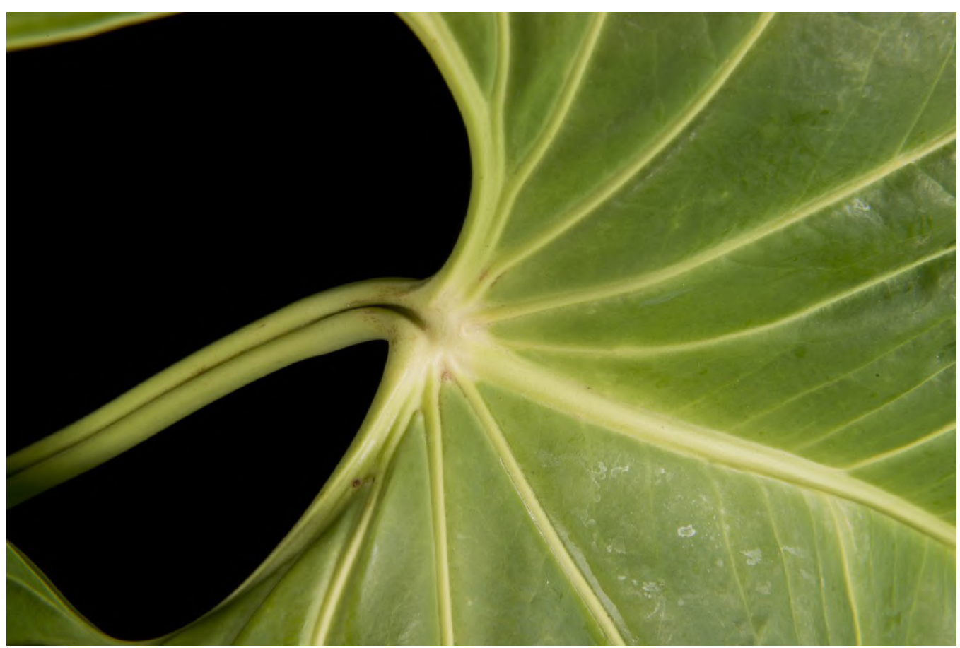
Figure 4. Anthurium alexandri Croat, Brownless & Belt. Leaf blade, adaxial surface with petiole.