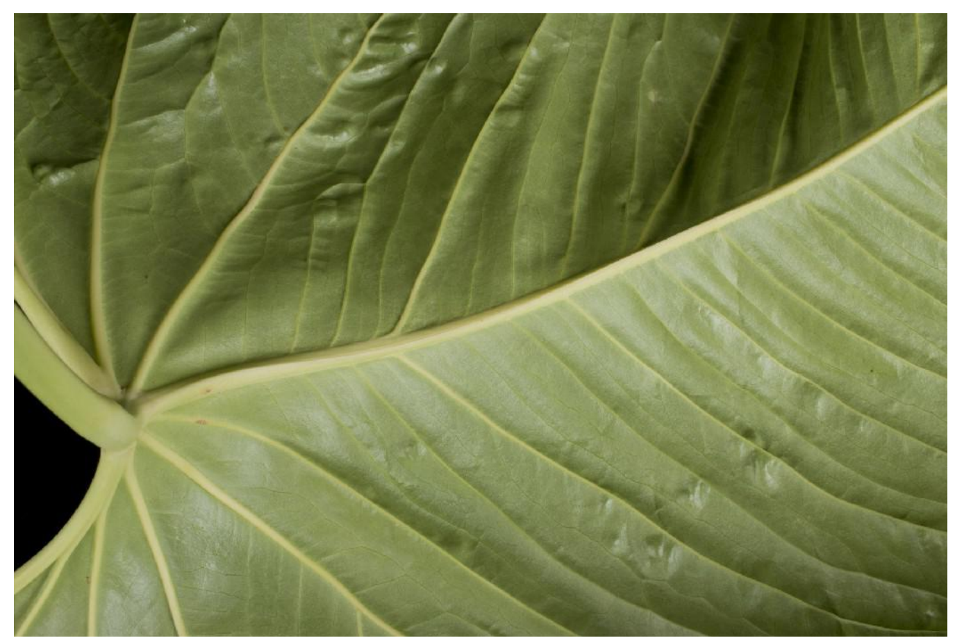
Figure 5. Anthurium alexandri Croat, Brownless & Belt. Leaf blade, abaxial surface showing base of leaf.