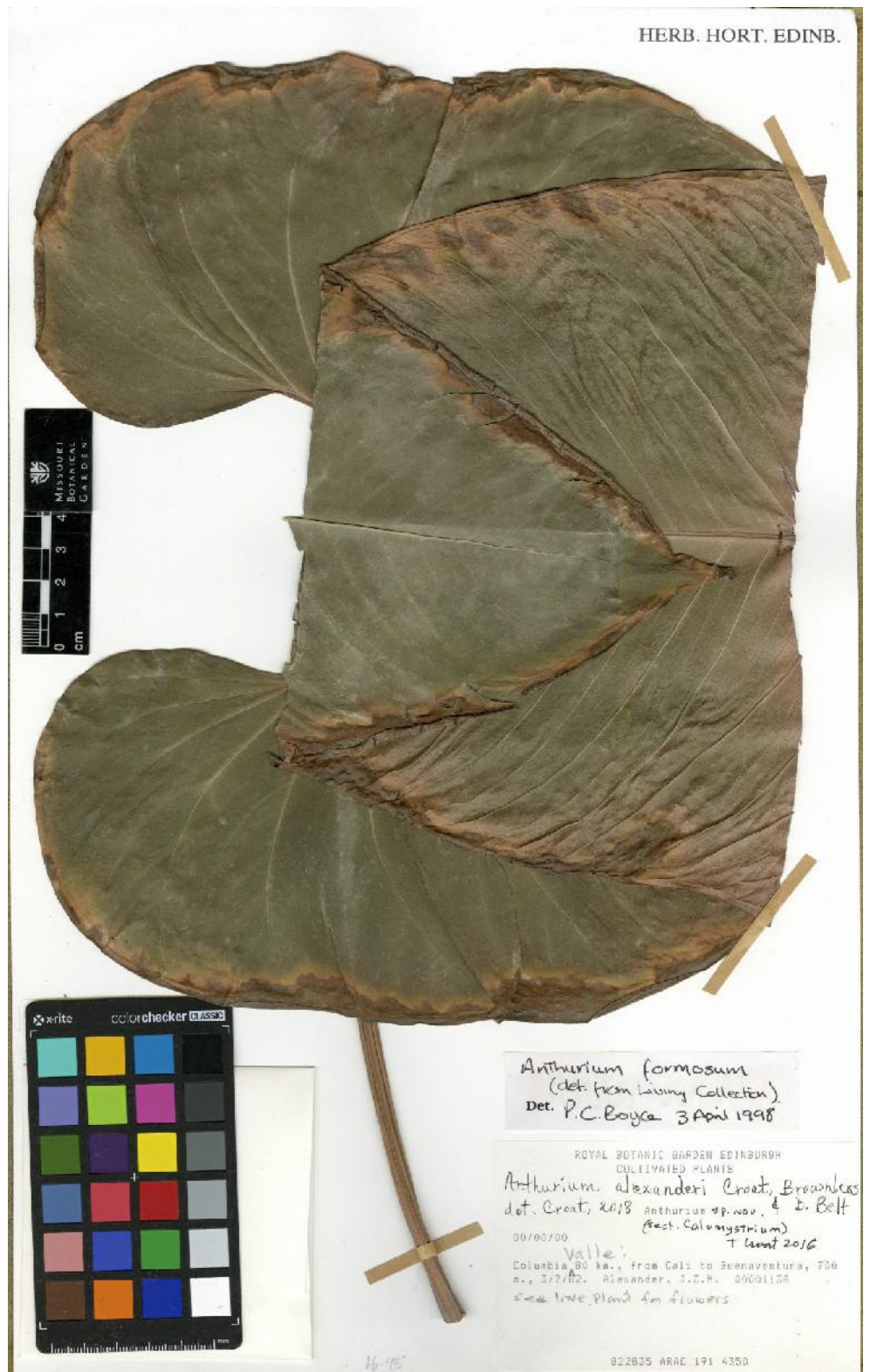
Figure 13. Anthurium alexandri Croat, Brownless & Belt. Herbarium specimen (P. Brownless 1235, E).