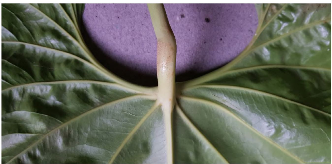
Figure 6. Anthurium alexandri Croat, Brownless & Belt. Base of leaf blade showing posterior rib.