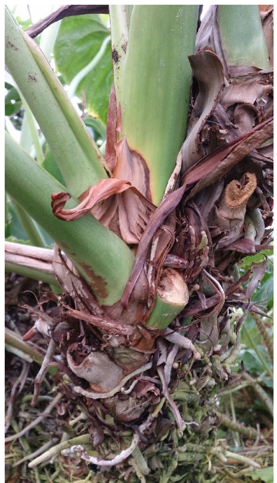
Figure 2. Anthurium alexandri Croat, Brownless & Belt. Stems with cataphylls and roots.