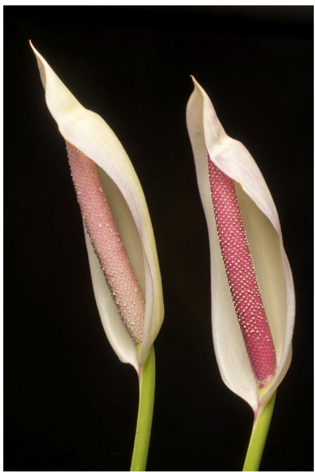
Figure 10. Anthurium alexandri Croat, Brownless & Belt. Inflorescences, on left showing female stage, on right showing male stage.