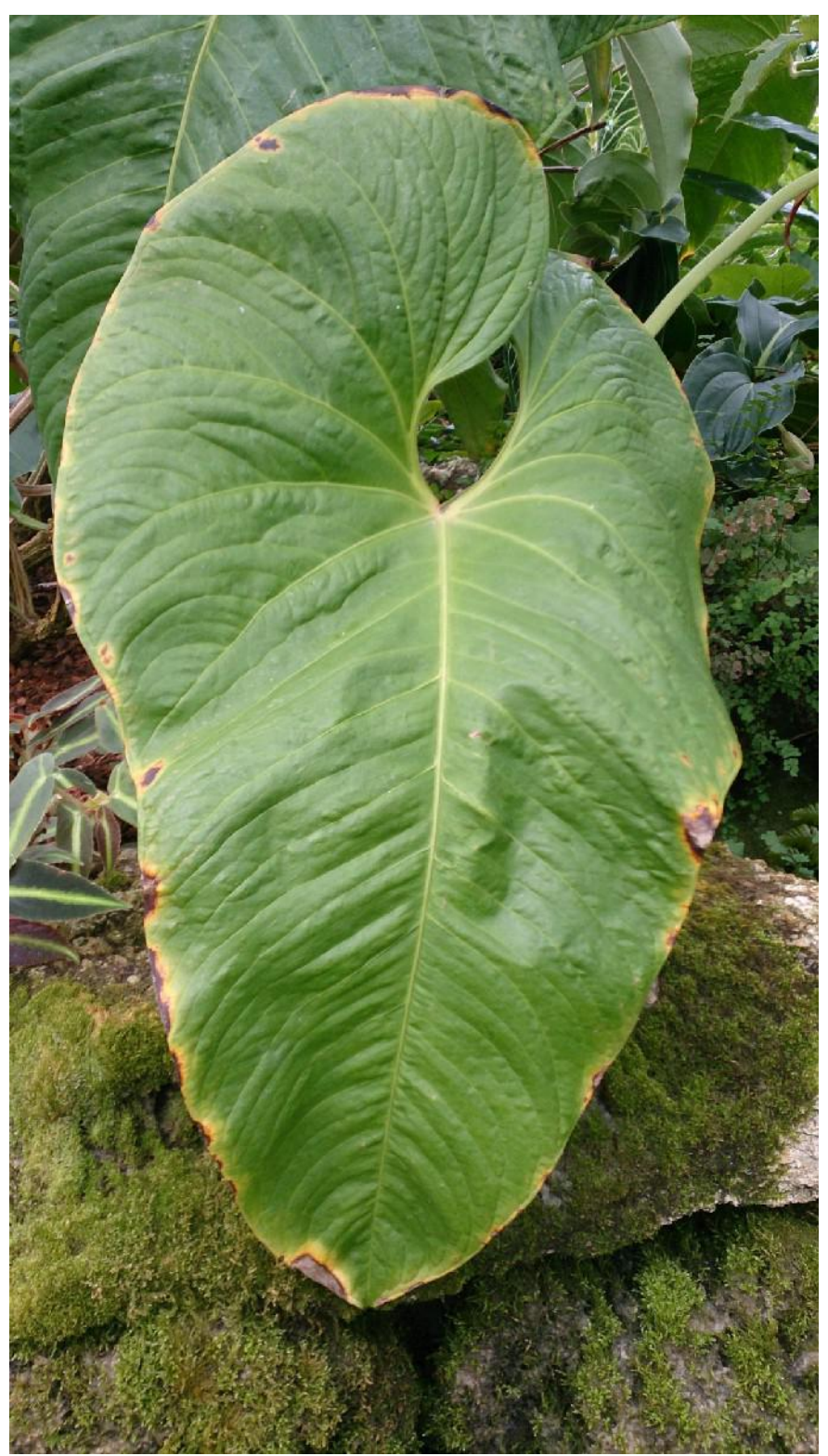
Figure 3. Anthurium alexandri Croat, Brownless & Belt. Leaf blade, adaxial surface.