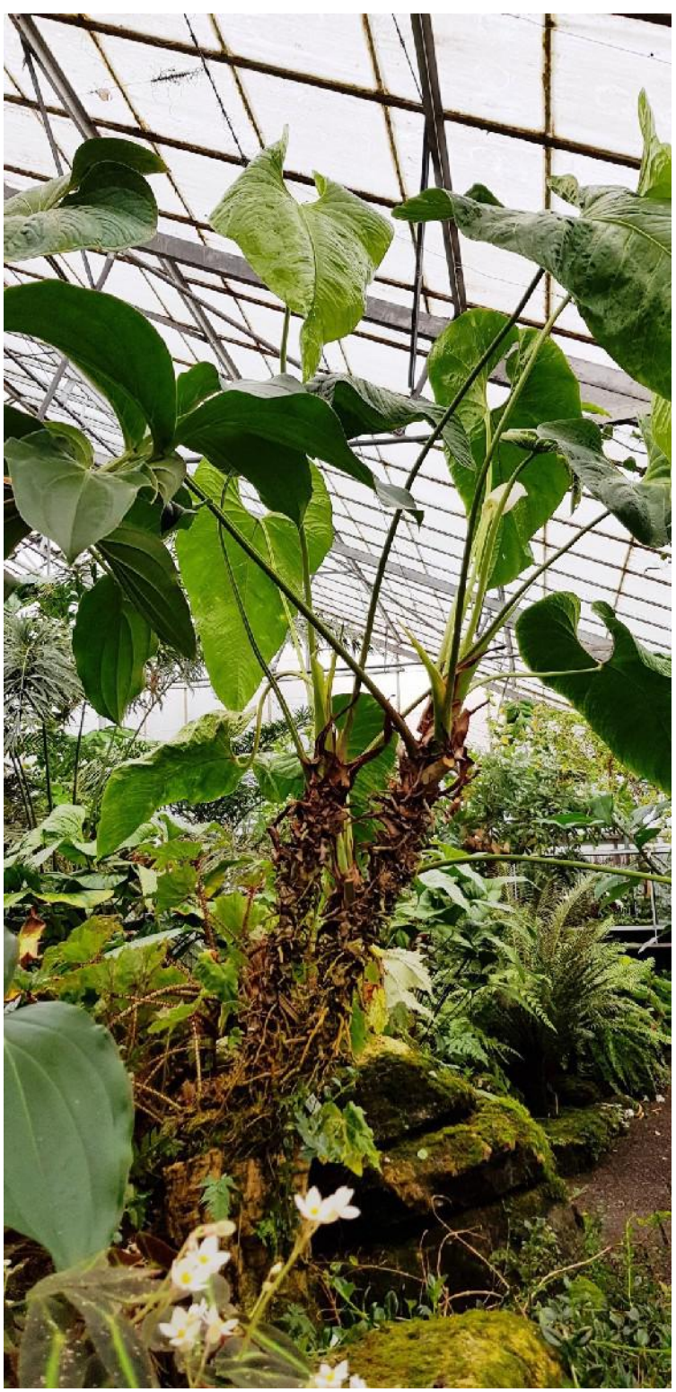
Figure 1. Anthurium alexandri Croat, Brownless & Belt. Habit in greenhouse. [Photo credits needed throughout??]