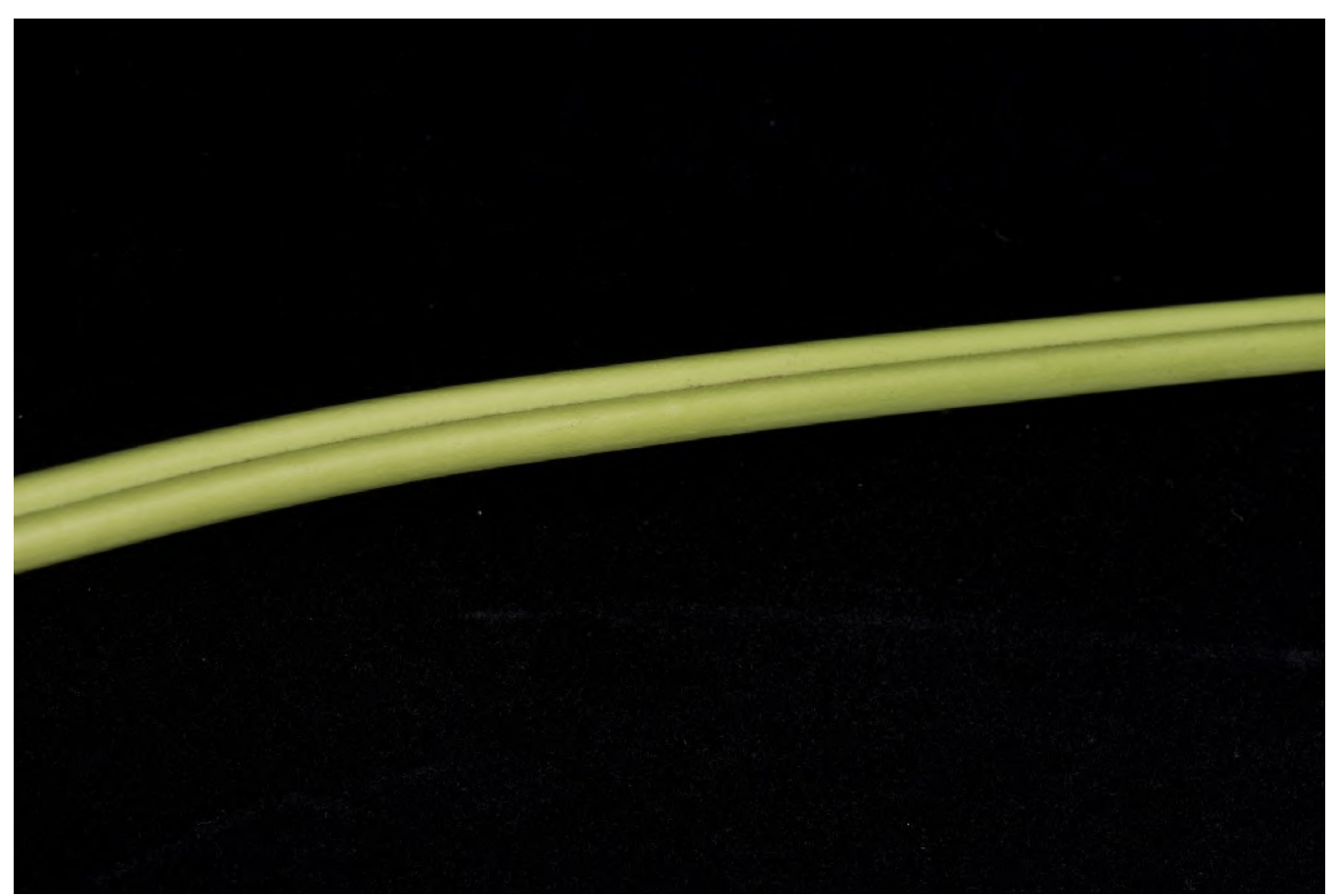
Figure 8. Anthurium alexandri Croat, Brownless & Belt. Petiole, adaxial surface.