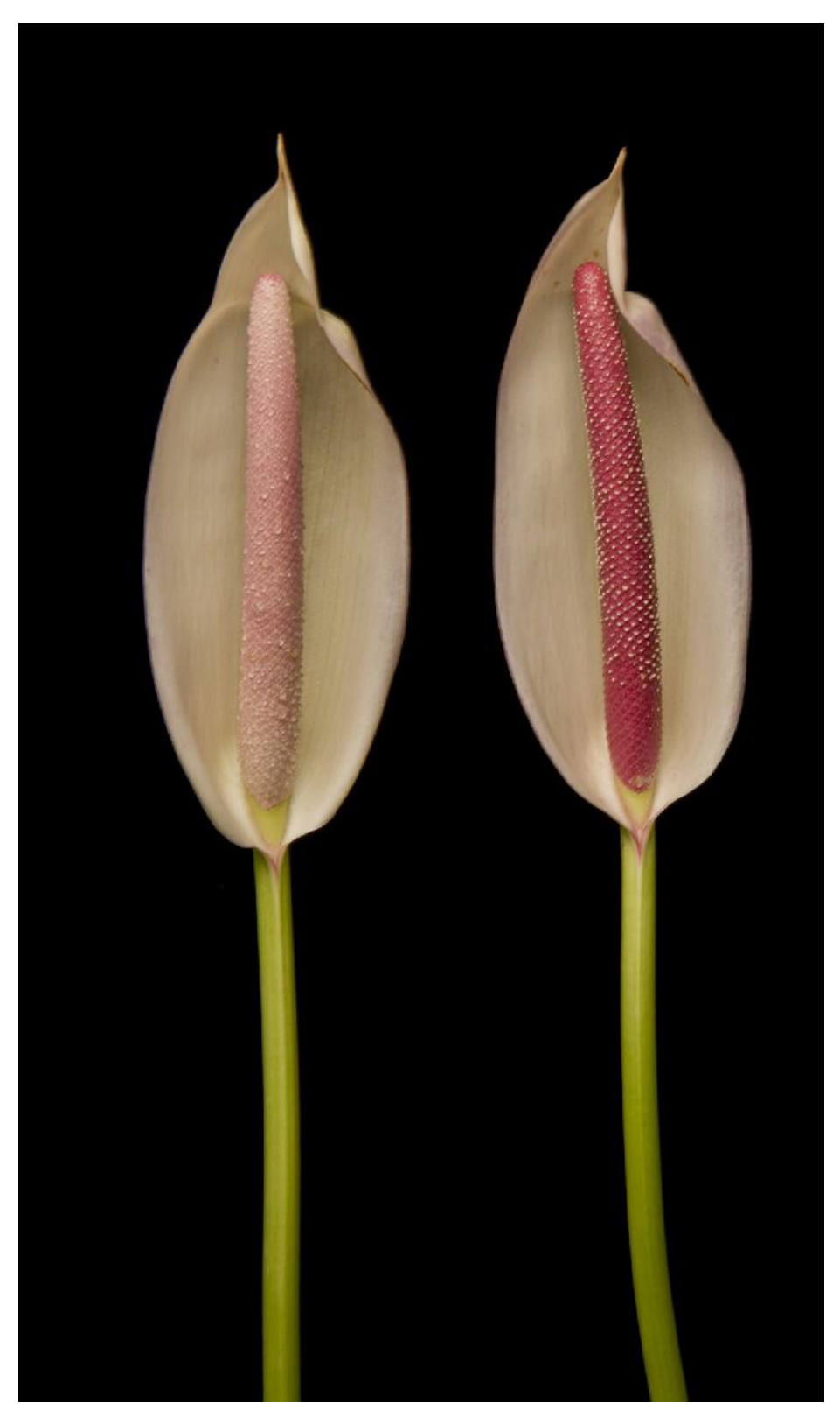
Figure 9. Anthurium alexandri Croat, Brownless & Belt. A pair of inflorescences, on left pre-anthesis, on right at anthesis.