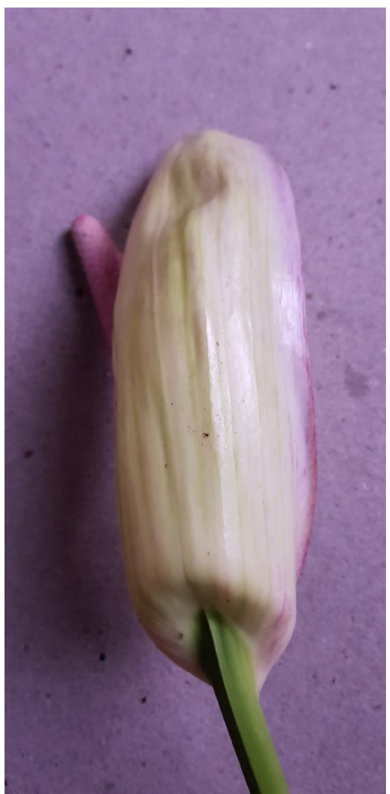
Figure 11. Anthurium alexandri Croat, Brownless & Belt. Spathe, abaxial surface.